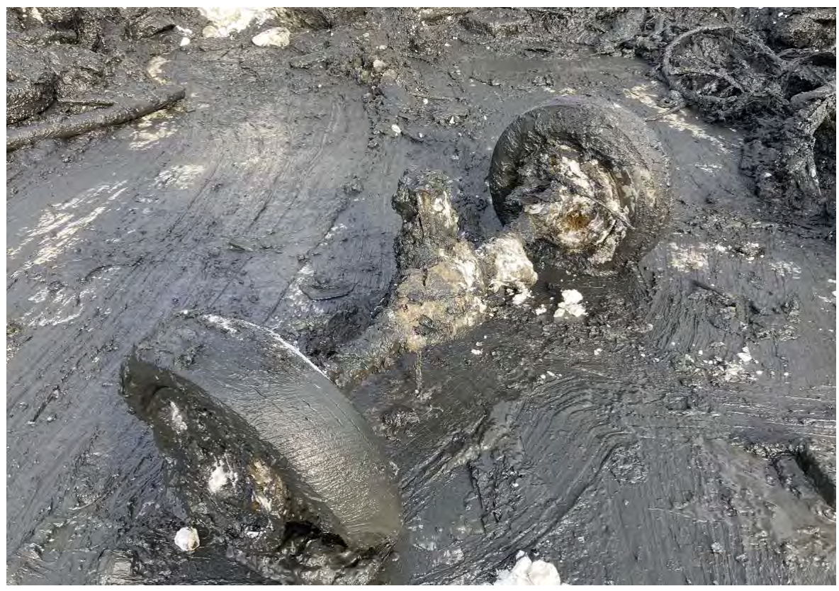
Photograph 2 – Example of car wheels, front view.