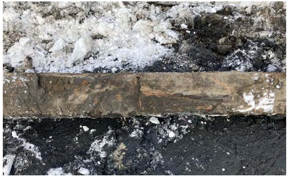
Photograph 5 – Example of possible notched bulk-head timber, front view.