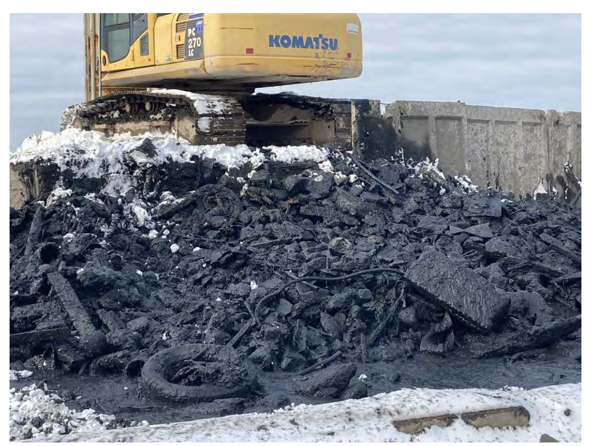
Photograph 1 - Overview of the amount of items reviewed, side view.

The recovered items were spread by machine on a flat hard surface to allow for an archaeologist to clearly review them Photographs 1 thru 6). Any item of potential interest was separated, rinsed and assessed. Approximately 50% of the items reviewed consisted of irregular shaped rocks averaging 10 inches in diameter (Photograph 1). The majority of the other items reviewed consisted of modern debris, including wheels (Photograph 2), large concrete blocks (Photograph 3) and wood and timbers including possible notched bulk-head timbers (Photographs 4 & 5). One item was recommended for retention; an approximately 3' long piece of wood that is curved and notched (Photograph 6). Additional research may be able to determine its use or what implement it was part of. The wooden object was set aside to be cleaned and will be assessed further documented next week.