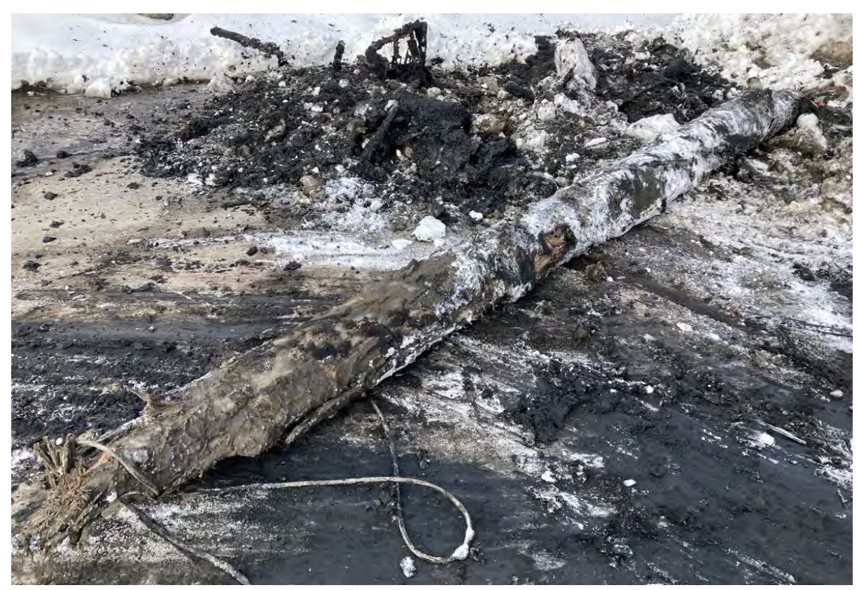
Photograph 4 – Example miscellaneous timber, front view.