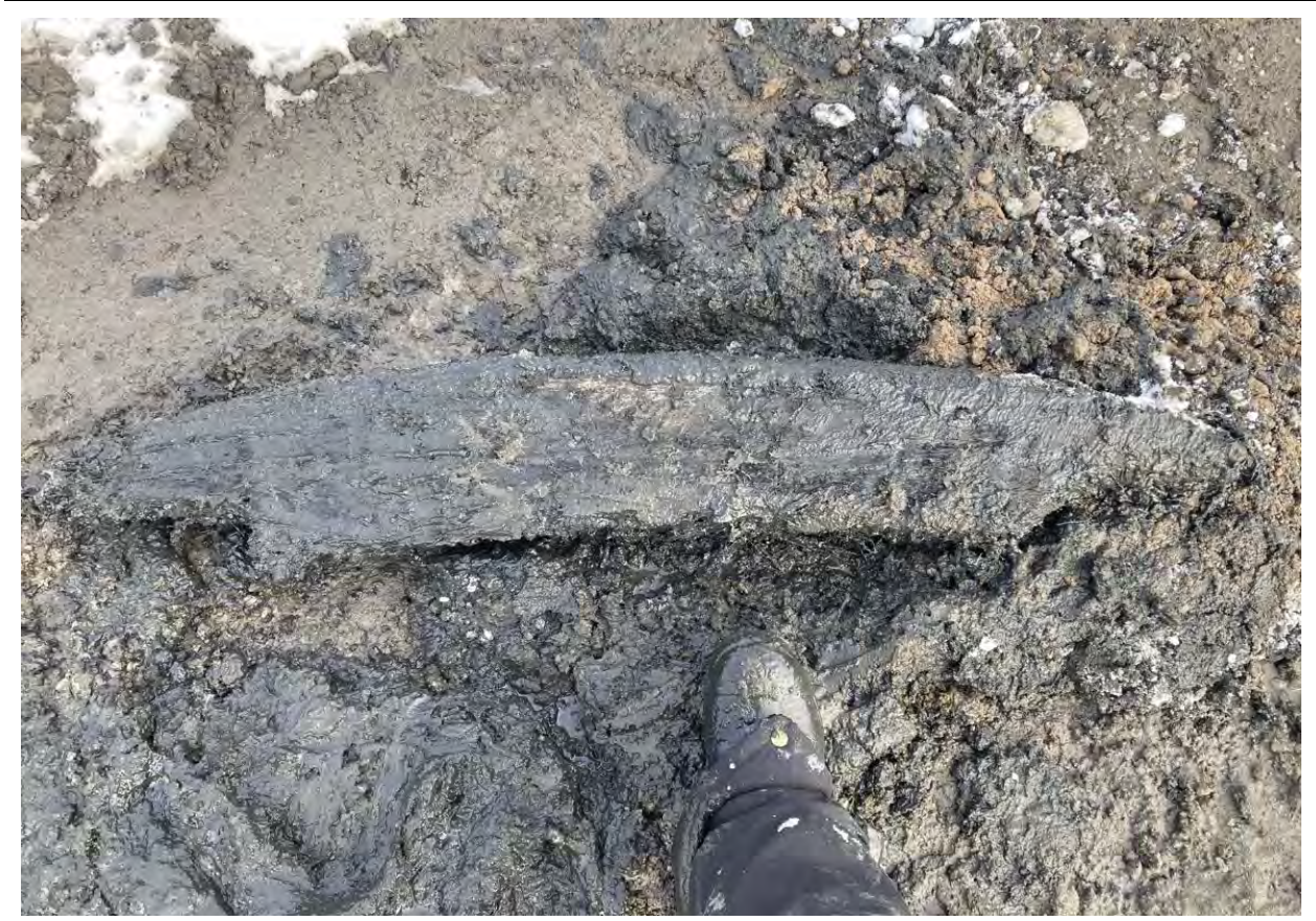
Photograph 6 - Retained, unidentified wooden object, front view.