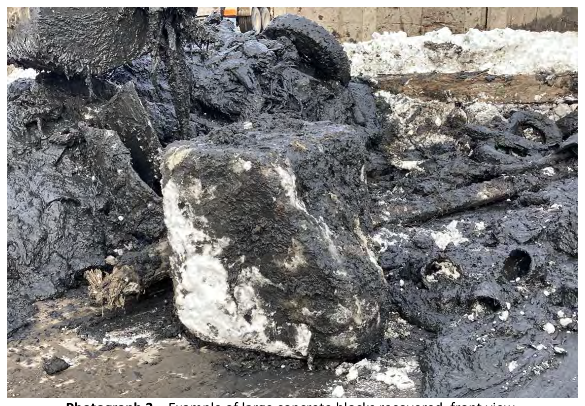
Photograph 3 – Example of large concrete blocks recovered, front view.