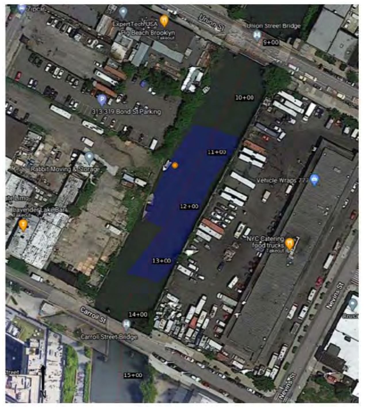
Figure 2 – Approximate Area Dredged between December 28, 2020 and December 31, 2020. Dredging was not conducted January 1, 2021. Figure Provided by the Trust.

: Debris found at N: 672646.22 ft, E: 633882.68 ft<sup>1</sup>, Elev.: -13 ft<sup>2</sup> on December 30, 2020.