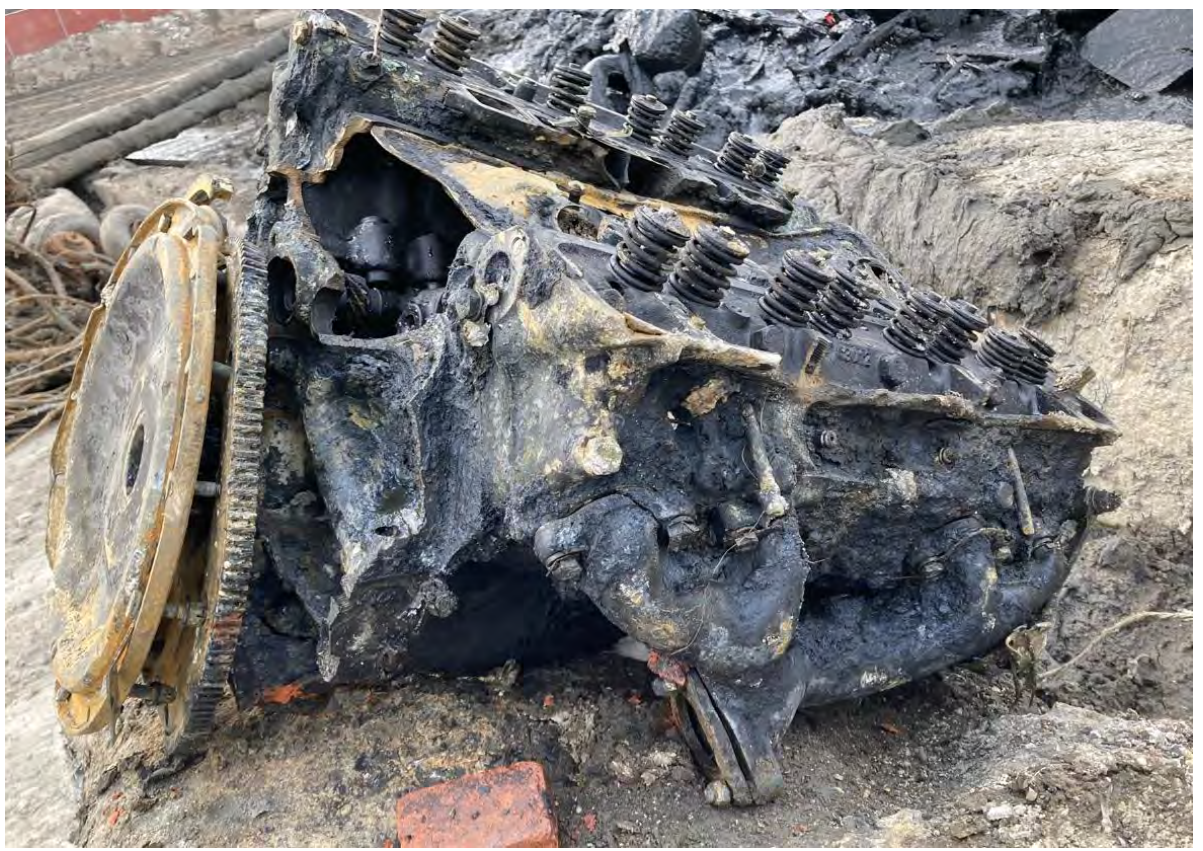
Photograph 2 – Example of car engine recovered, front view.