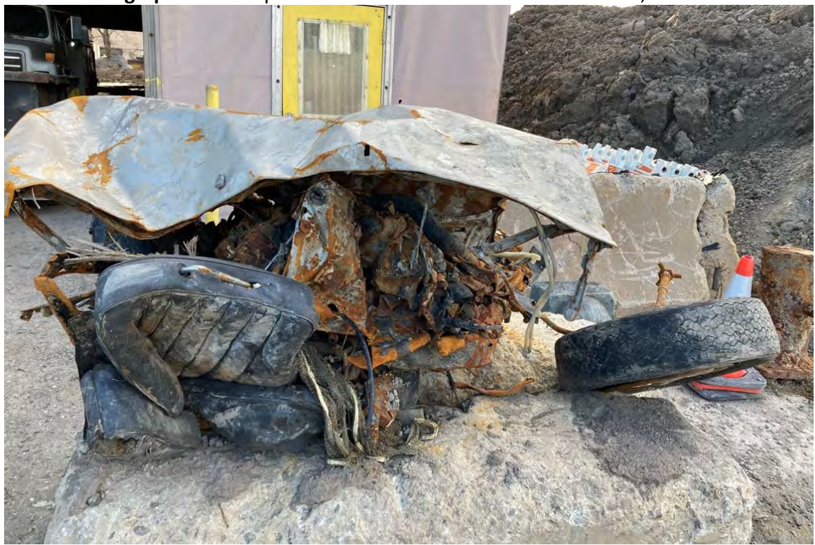
Photograph 7 – Example car that arrived on site recently, front view.