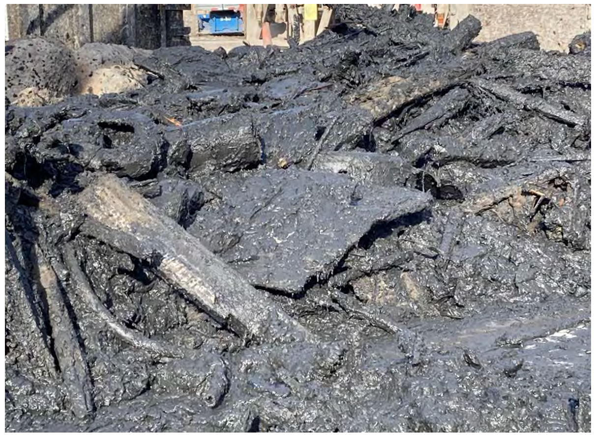
Photograph 1 – View of ply wood and other wood.

AHRS reviewed photographs of items recovered from Clean Earth sediment screening on 1/5/21 and 1/7/21 prior to the site visit. The recovered items were spread by machine on a flat hard surface to allow for an archaeologist to clearly review them, Photographs 1 thru 14. Any item of potential interest was separated, rinsed and assessed. The majority of the material reviewed consisted of small milled lumber and plywood (Photograph 1). The other items reviewed consisted of modern debris, including car engines (Photograph 2), tires and large concrete blocks (Photograph 3) and larger timbers (Photograph 4). In addition, several cars of modern vintage that arrived on site in December were reviewed (Photographs 5 & 6) as well as two cars that arrived on site recently (Photographs 7 & 8). A large quantity of timber pilings that were separated from the other material prior to the site visit were also reviewed (Photograph 9). Three items were recommended for retention; A small cast iron stove (Photographs 10 & 11), a piece of unidentified machinery or motor (Photograph 12) and a large piece of curved timber (Photographs 13). All three items were rinsed and put inside the storage area (Photographs 14). The stove has a rope tied around it suggesting it was used as an anchor of some kind.