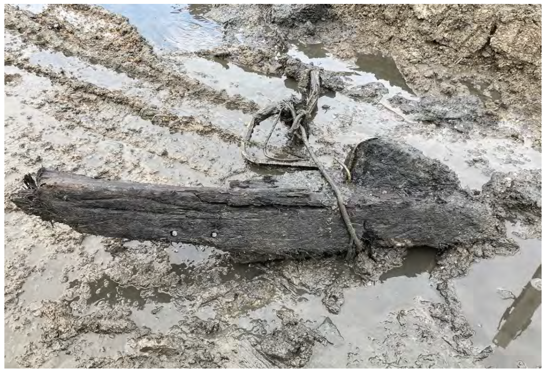
Photograph 13 – Unidentified piece of curved wood, front view.