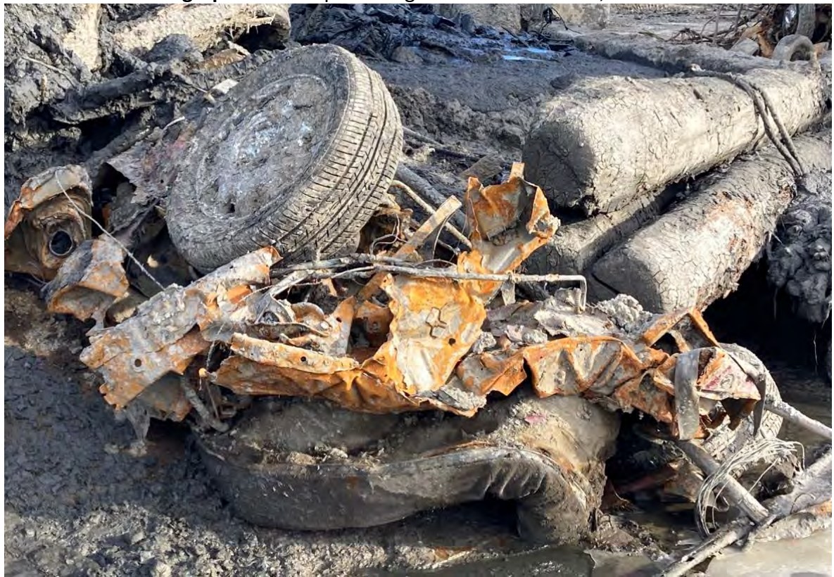
Photograph 5 – Example car that arrived in December, front view.