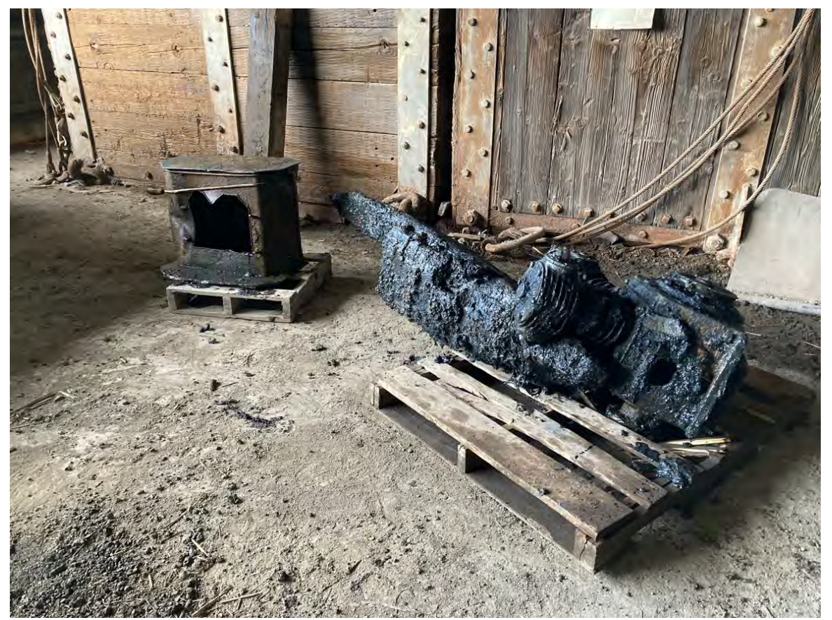
Photograph 14 – Items of interest: stove, machine and wood in storage area, front view.