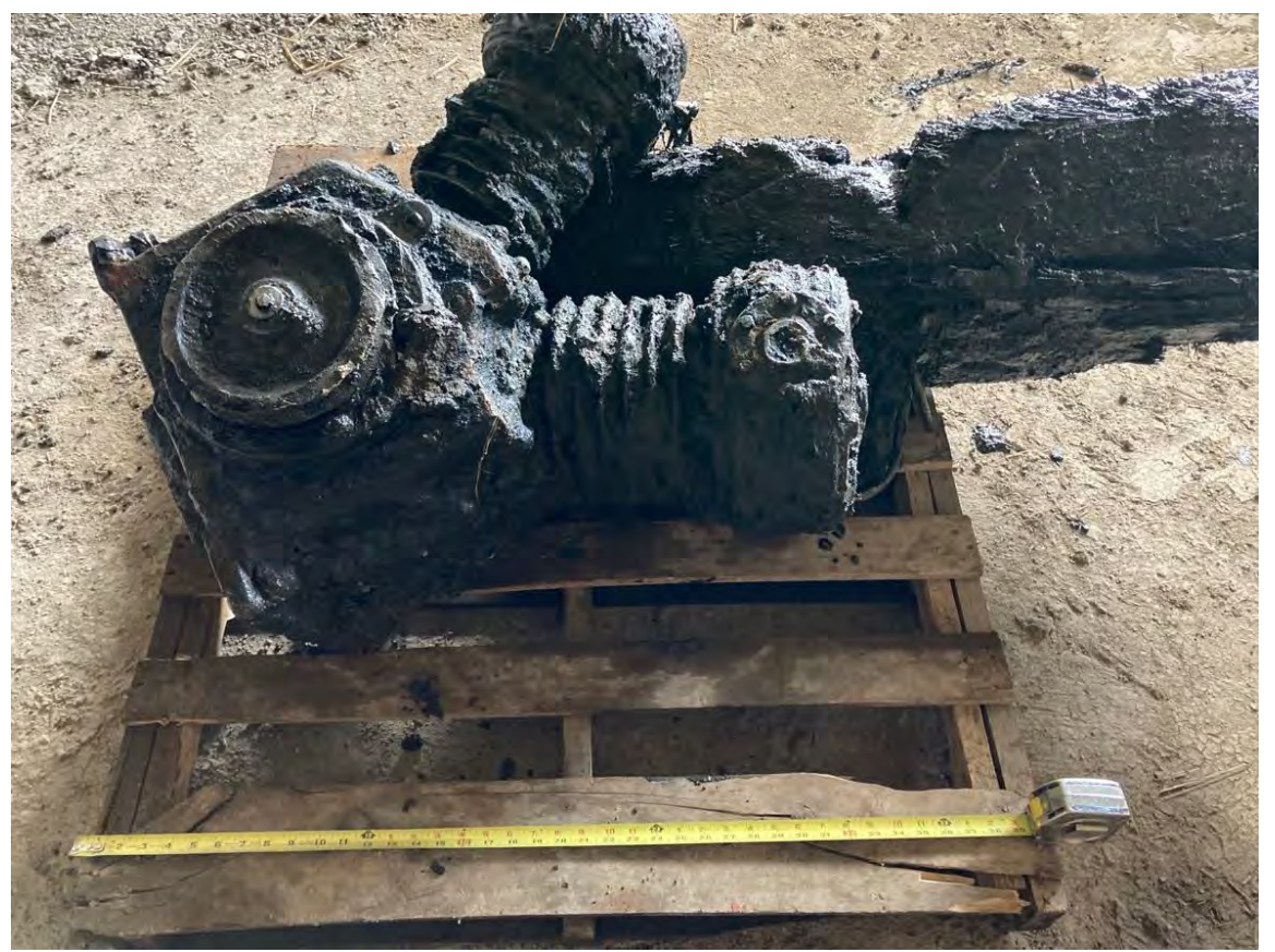
Photograph 12 – Unidentified machine or motor, front view.