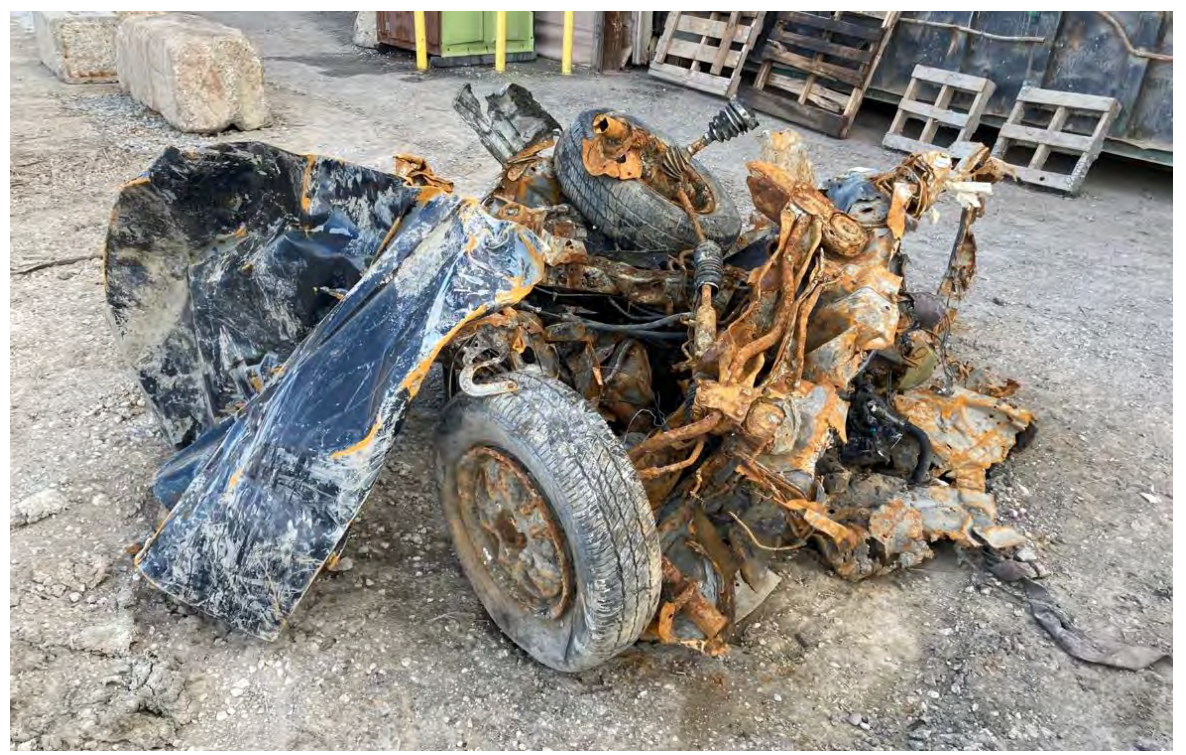
Photograph 8 – Example of another car that arrived on site recently, front view.