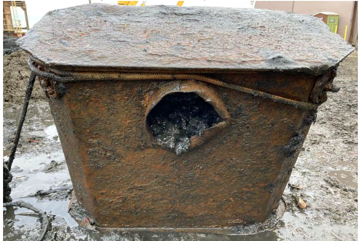
Photograph 11 – Iron stove, back view.

Photograph 10 – Iron stove with rope tied to it, front view.