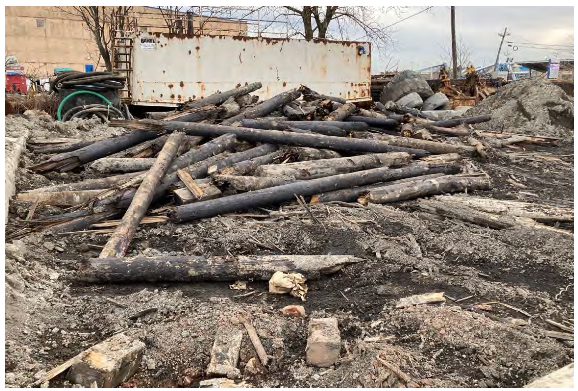
Photograph 9 – Example pre-sorted timbers, front view.