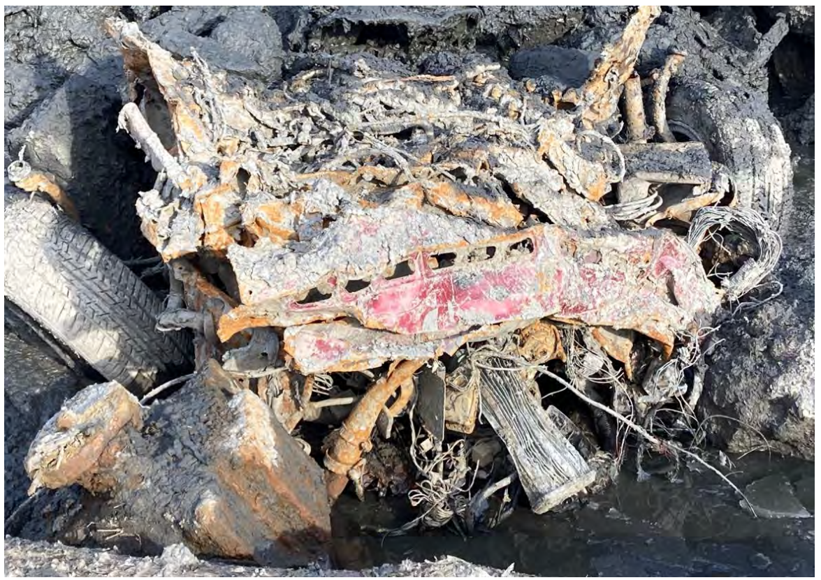
Photograph 6 – Example a second car that arrived in December, front view.