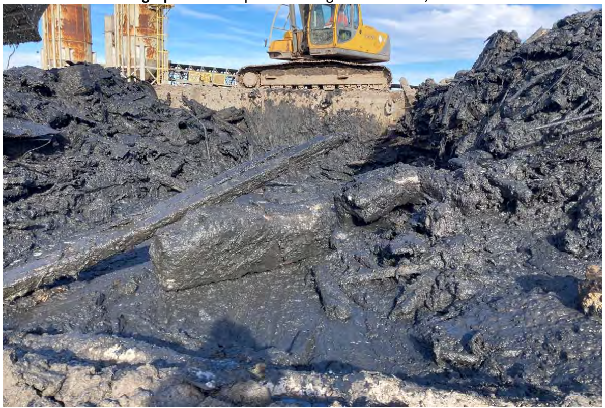
Photograph 3 – Example of large concrete blocks, front view.