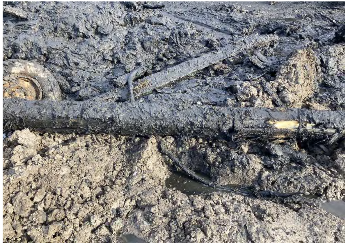
Photograph 4 – Example of large timbers recovered, front view.