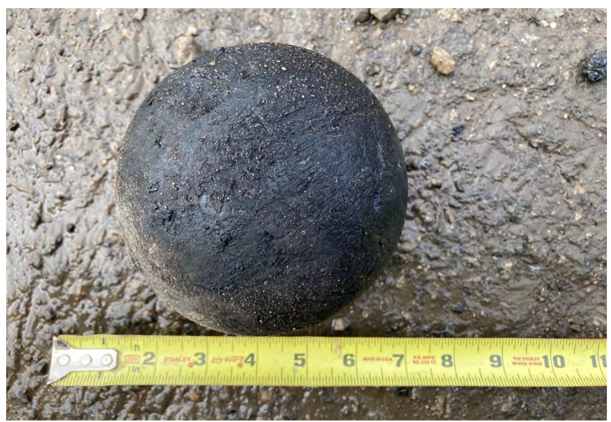
Photograph 9 – View of wooden ball, front view.