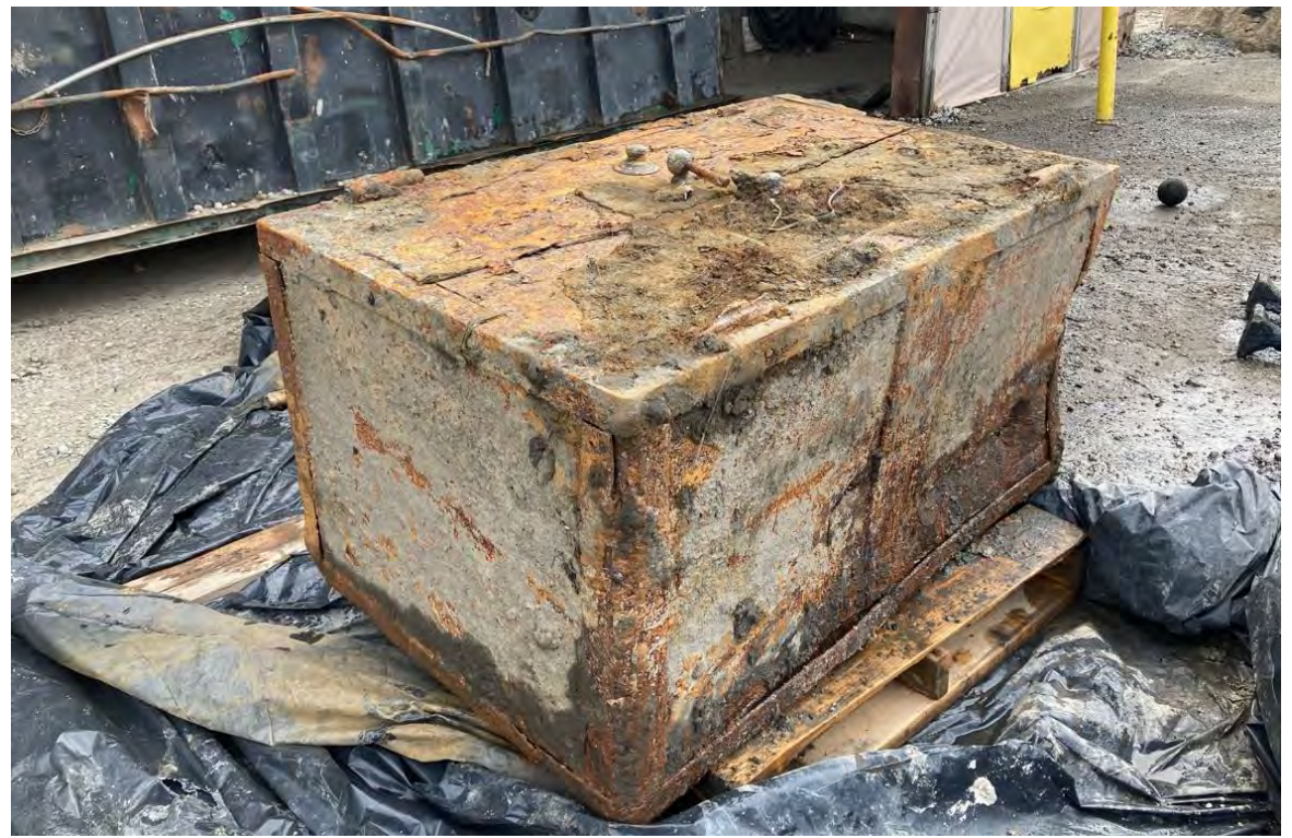
Photograph 6 – View of the safe, front view.