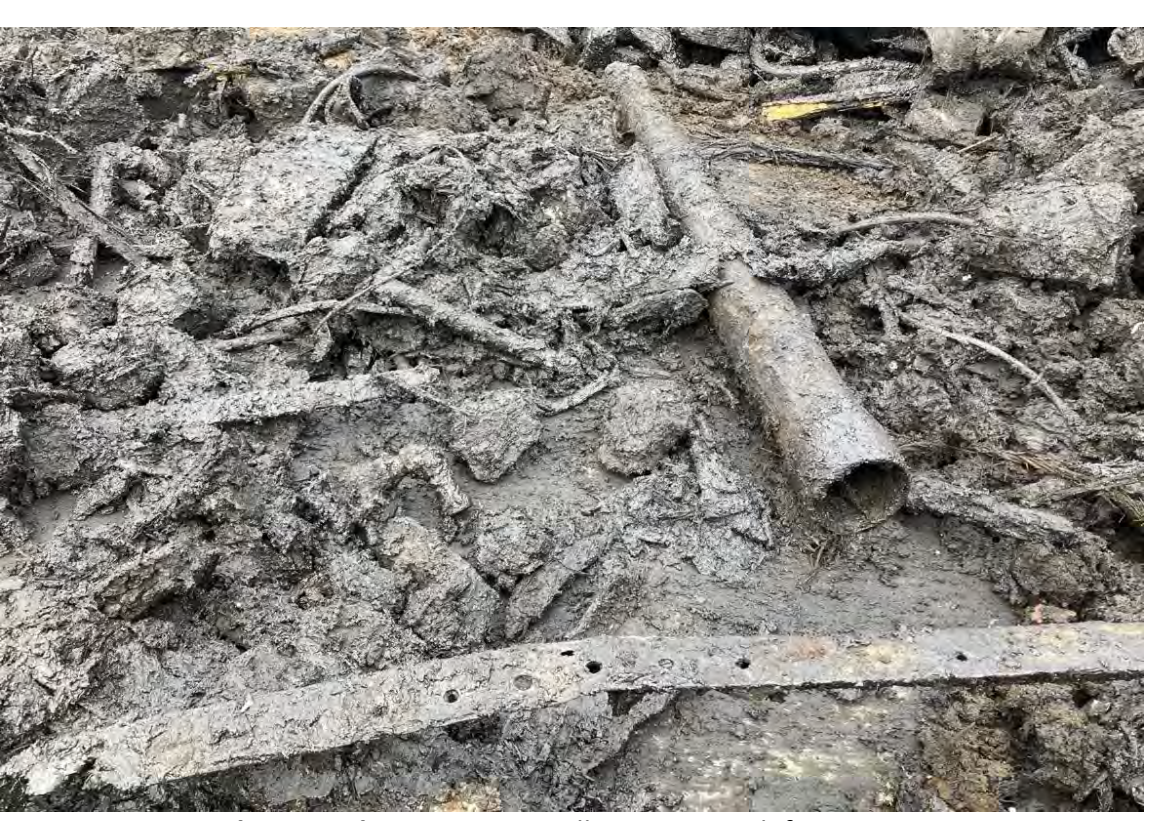
Photograph 4 – View miscellaneous metal, front view.