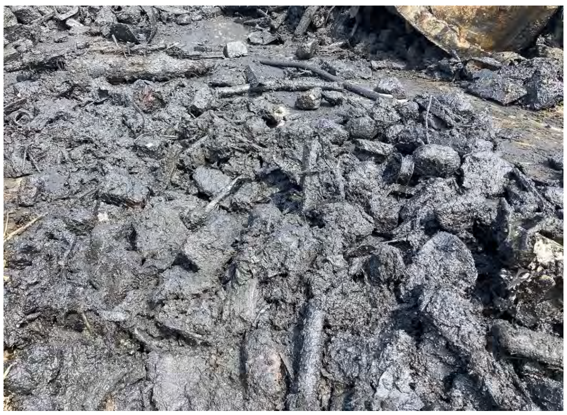
Photograph 2 – Close up of the condition of the material to be reviewed, front view.