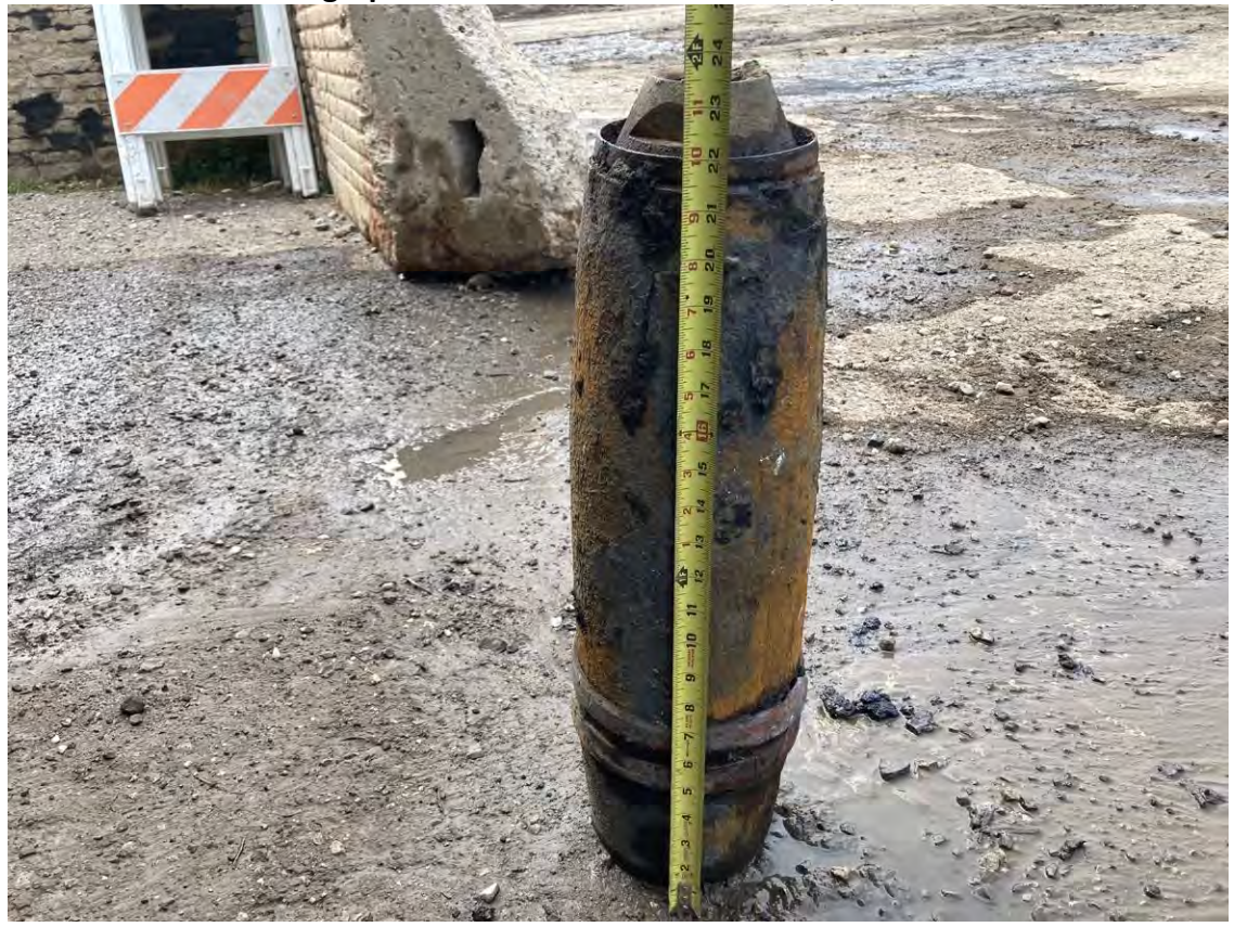
Photograph 5 – View of the projectile, front view.