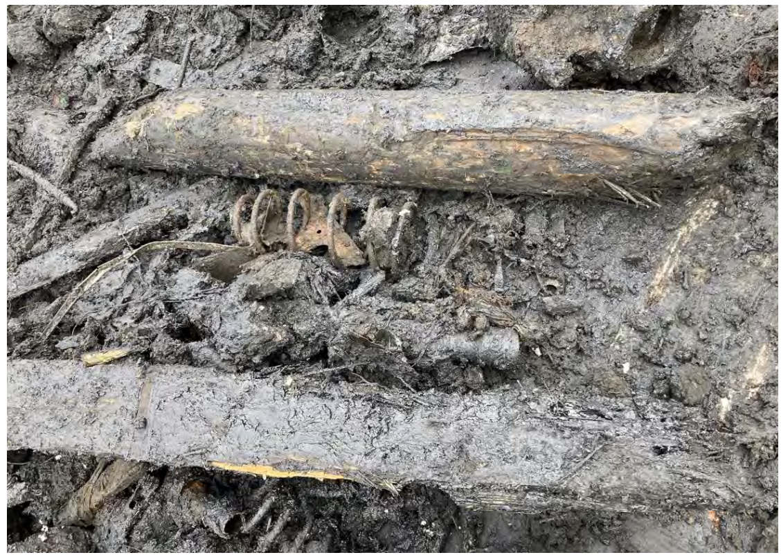
Photograph 3 – Example of large timber, front view.