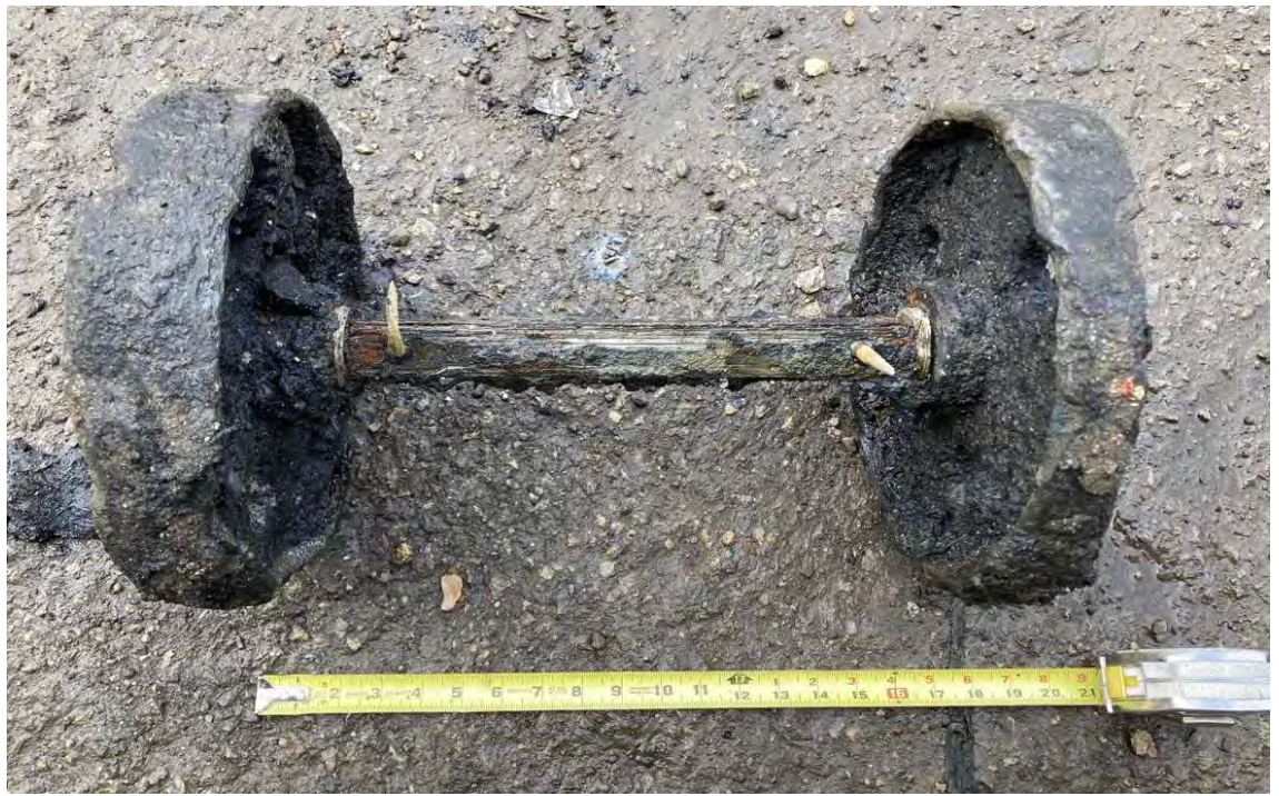
Photograph 8 – View of metal wheels, front view.