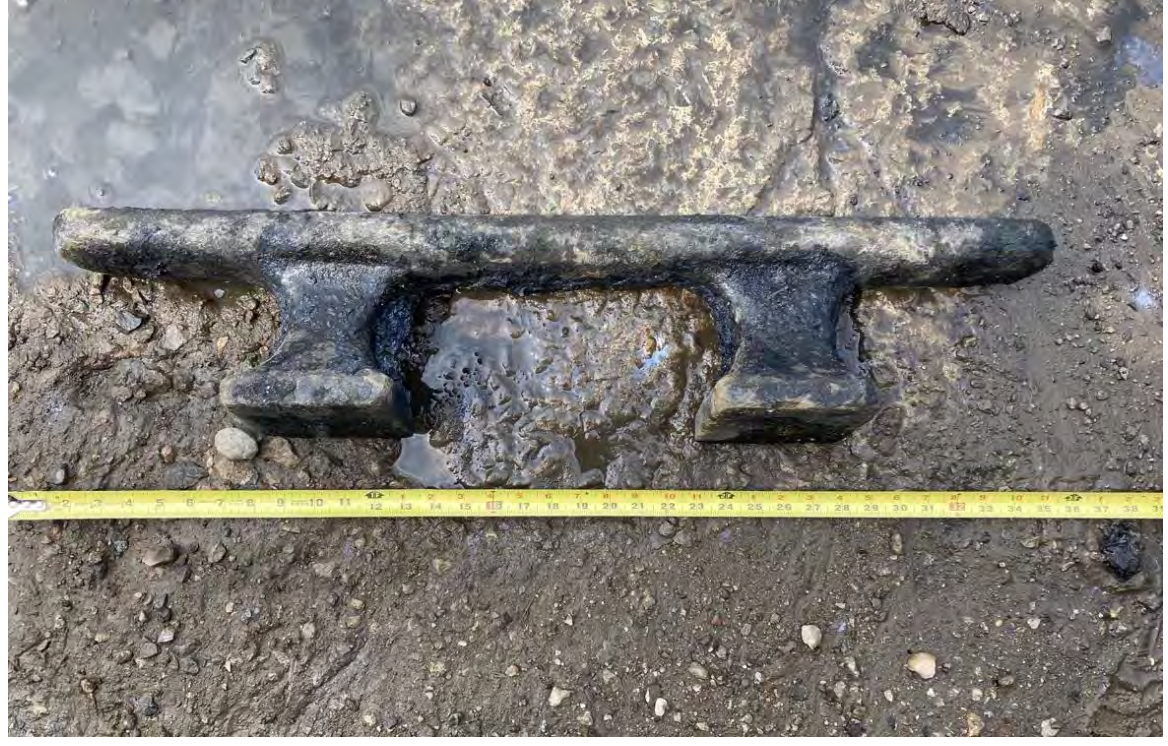
Photograph 7 – View of the iron cleat, front view.