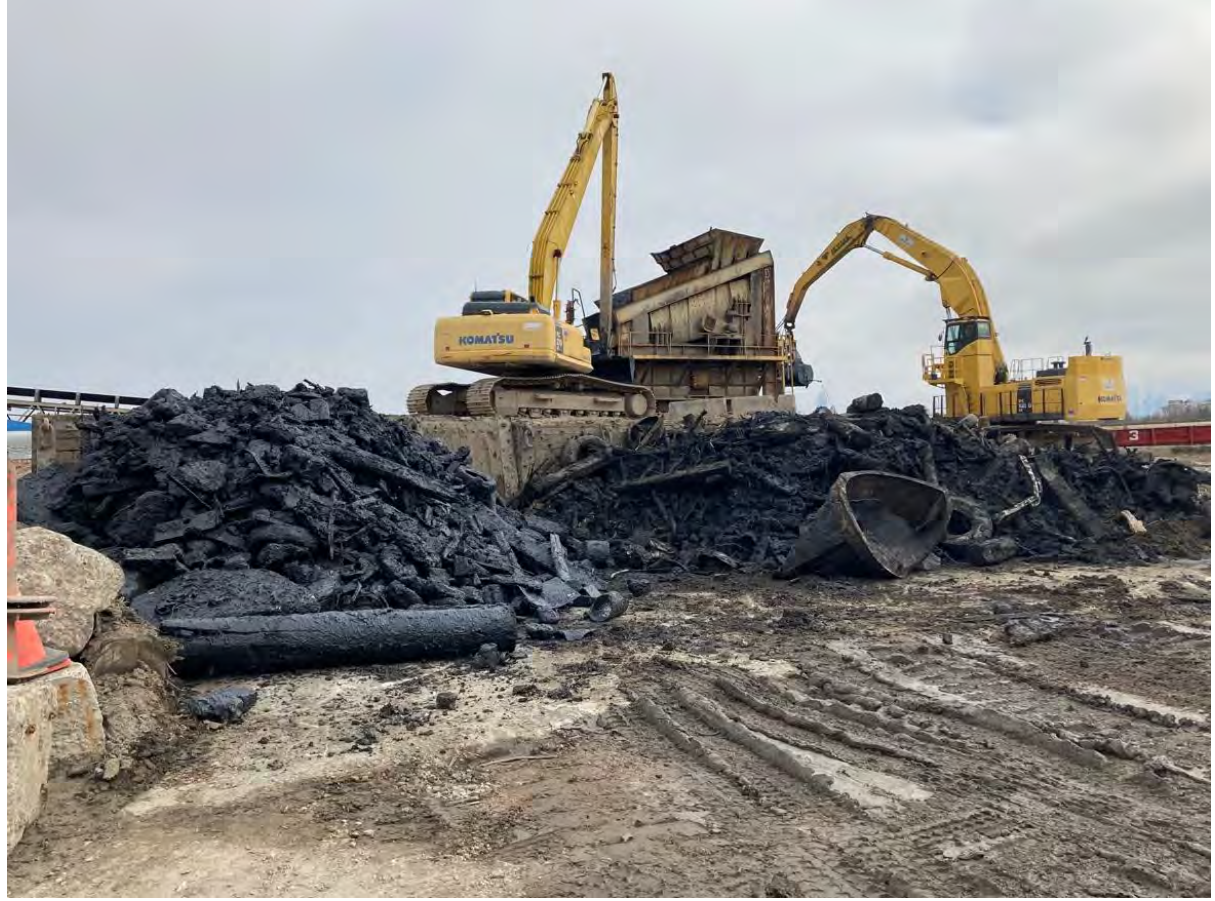
Photograph 1 – View of debris piles to be reviewed, front view.

The recovered items were spread by machine on a flat hard surface to allow for the archaeologist to clearly review them (Photograph 1). Any item of potential interest was separated, rinsed and assessed. The reviewed material consisted two piles of unsorted and muddy debris comprised of concrete fragments, rocks, large and small pieces of wood and timber (Photograph 2 and 3), miscellaneous metal (Photograph 4), tires and car parts. Two items were recovered at the canal site and were delivered, cleaned and put to the side at Clean Earth prior to the site visit. The first item was a partial non-active, inert military military projectile (Photograph 5). The second item was a large metal safe (Photograph 6). In addition, three items were recovered during the material review and retained: an iron cleat used to tie off a boat to a dock with a rope (Photograph 7), a set of metal cart wheels connected by a wooden axle (Photograph 8) and a small wooden ball (Photograph 9).