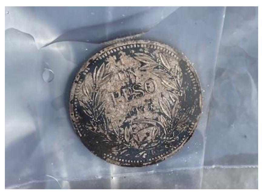
Photograph 3 – Peso dated 1975.