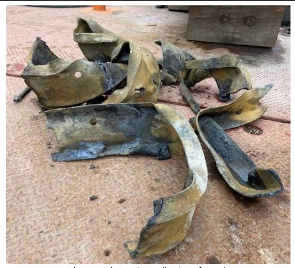
Photograph 1 – View collection of metal.