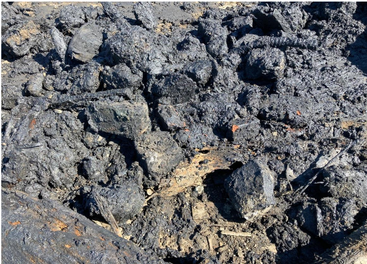
Photograph 4 – Example of rocks, front view.