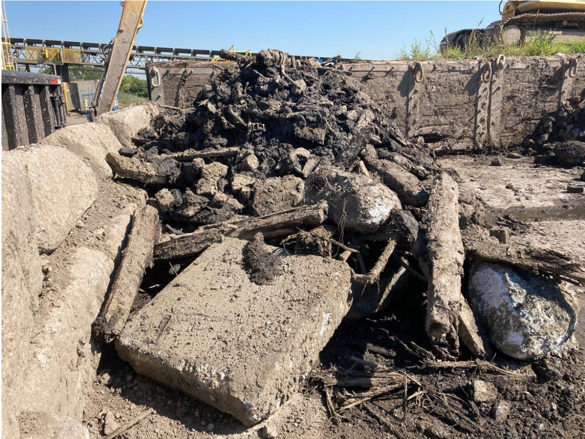
Photograph 1 – View of debris pile to be reviewed, front view.

The recovered material was spread by machine on a flat hard surface to allow for an archaeologist to clearly review it (Photograph 1). The reviewed material was comprised of mostly oily mud with debris comprised of concrete, wood, rocks, tires and miscellaneous metal (Photograph 2, 3, 4 and 5). No items of potential interest were observed.