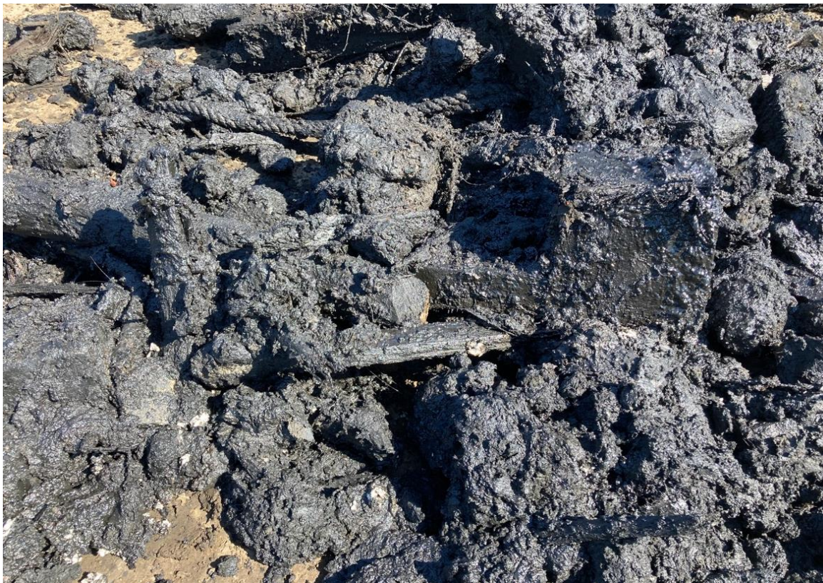
Photograph 2 – Close up of the condition of the material to be reviewed, front view.