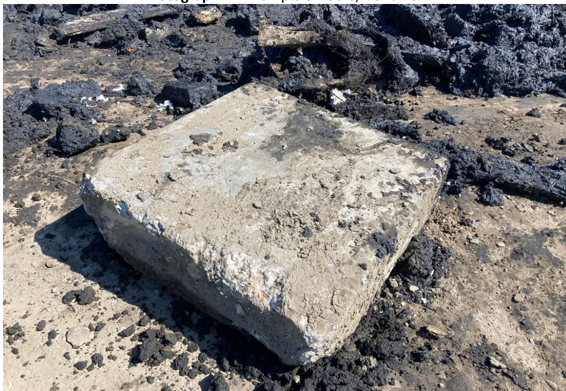
Photograph 5 – View of large concrete block.