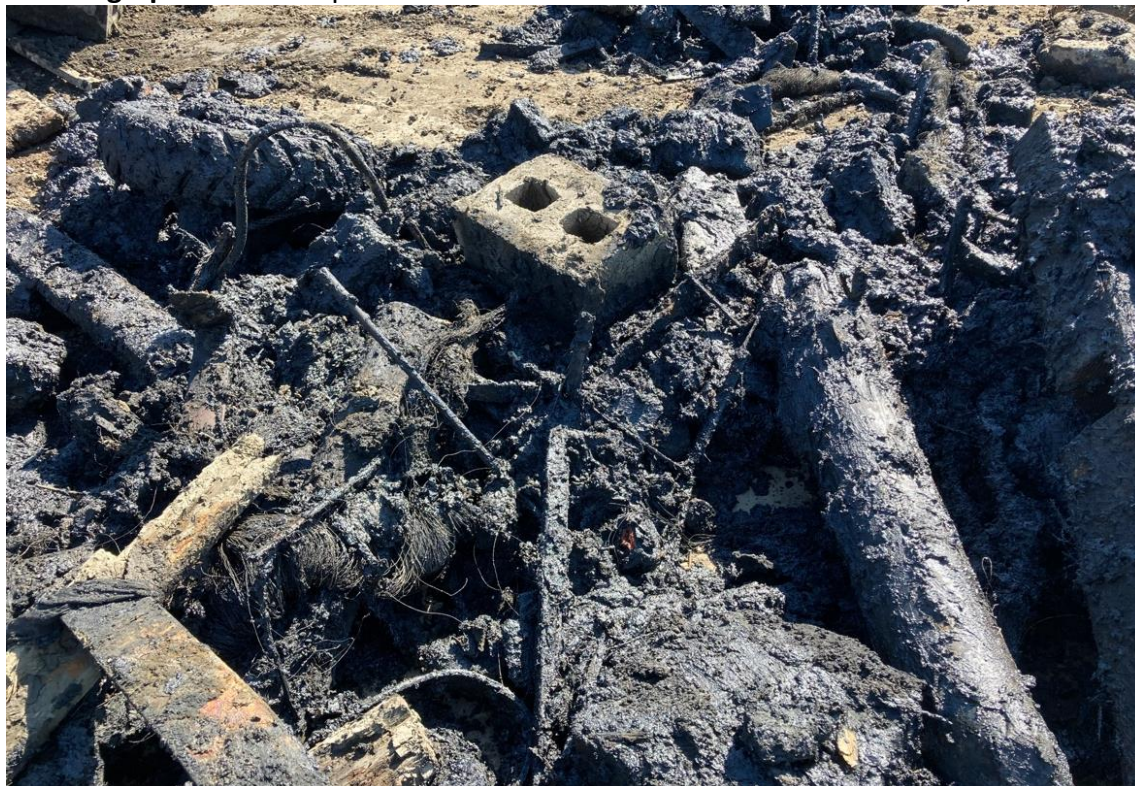
Photograph 3 – View of concrete, wood, tire and metal front view.