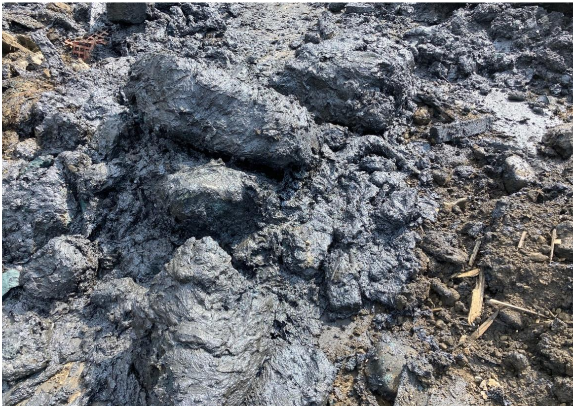
Photograph 4 – Example of rocks, front view.