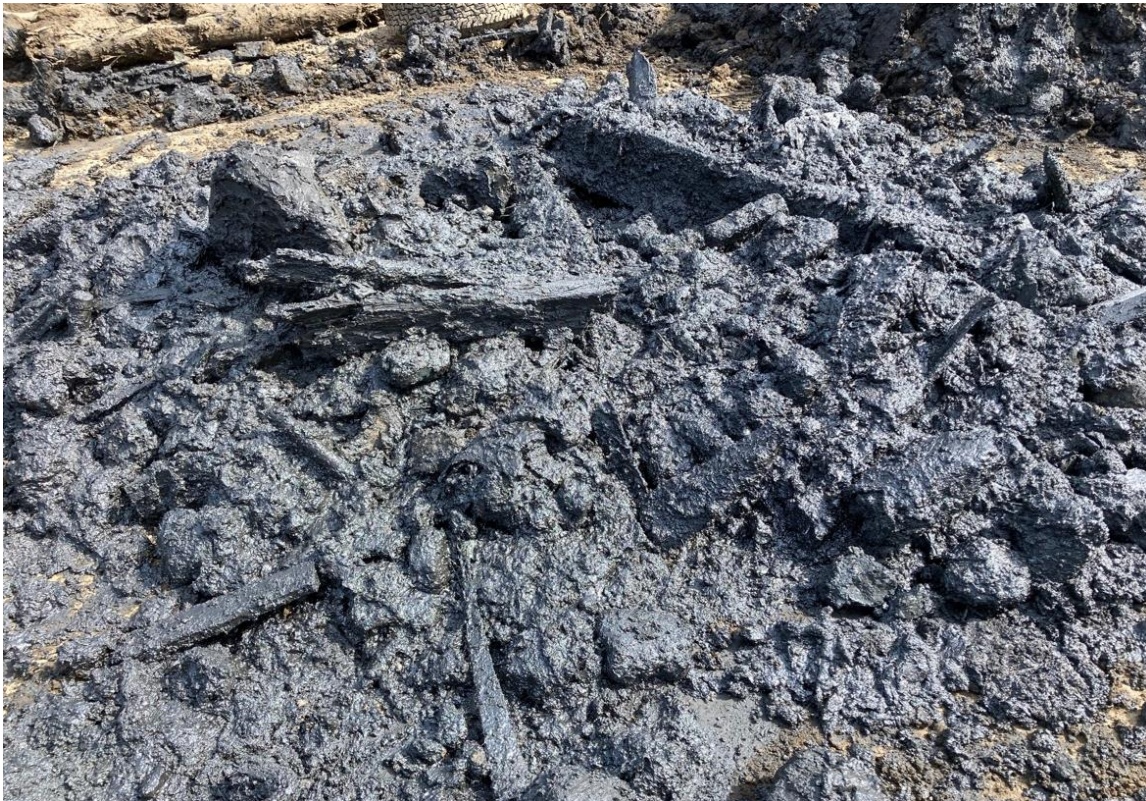
Photograph 2 – Close up of the condition of the material to be reviewed, front view.