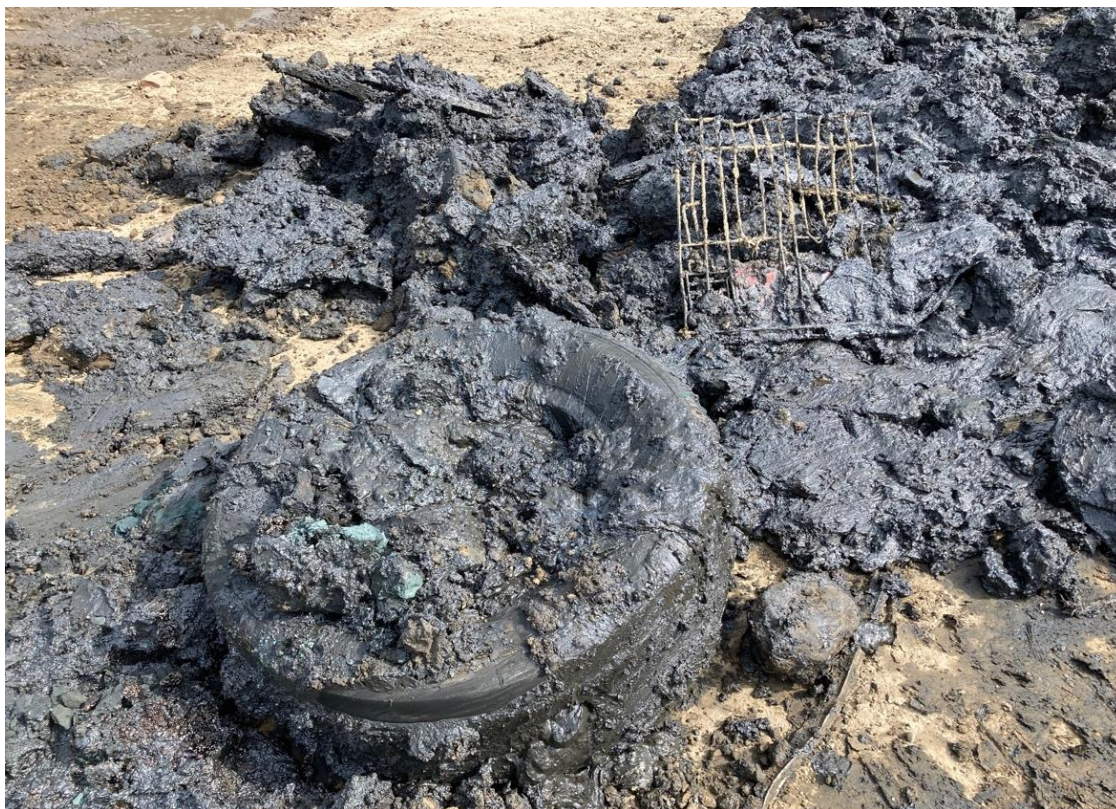
Photograph 3 – View of tire and metal front view.