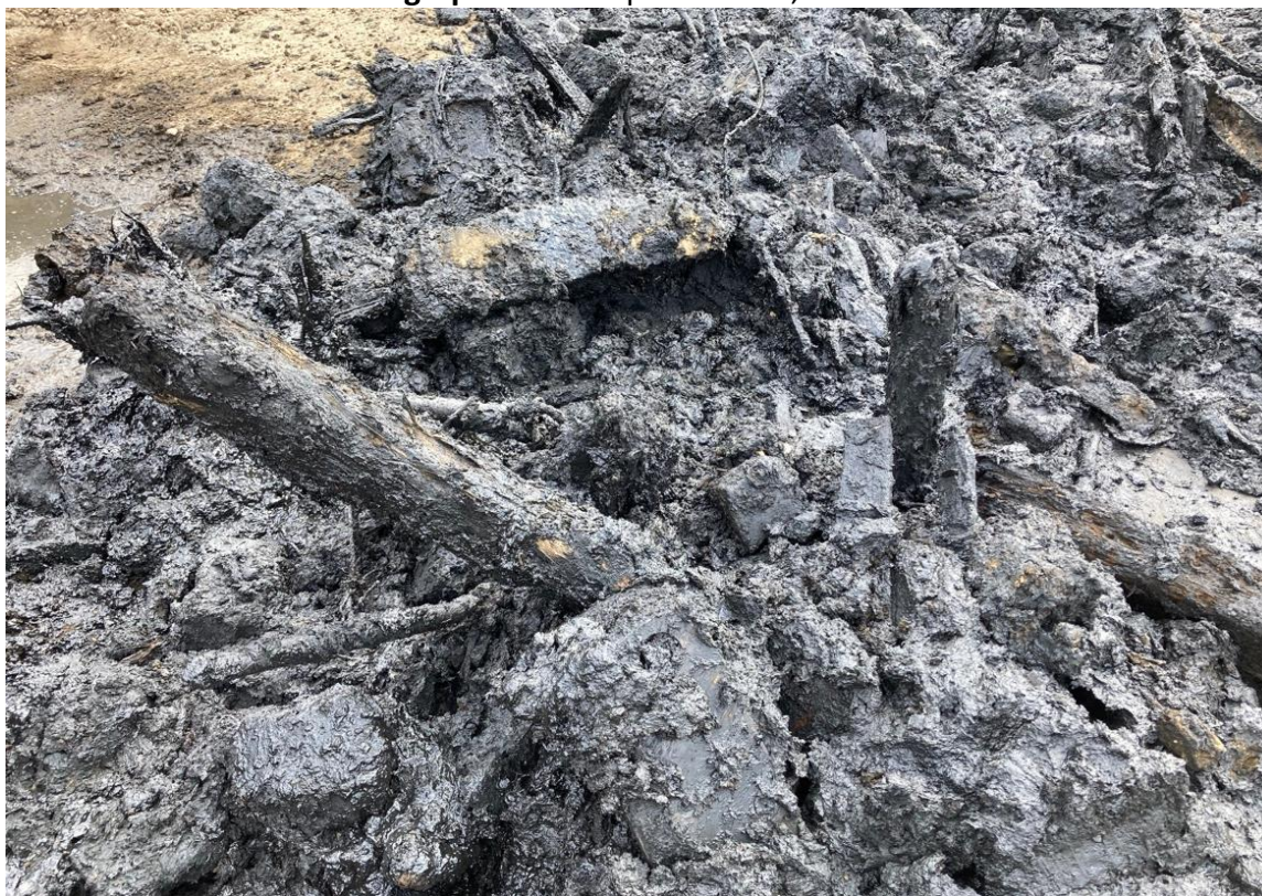
Photograph 5 – View of wood fragments.