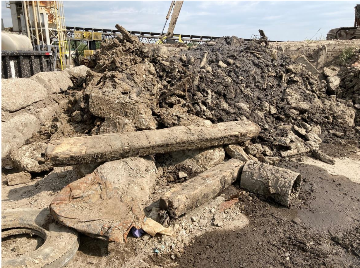
Photograph 1 – View of debris pile to be reviewed, front view.

The recovered material was spread by machine on a flat hard surface to allow for an archaeologist to clearly review it (Photograph 1). The reviewed material was comprised of mostly oily mud with debris comprised of wood fragments, rocks, tires and miscellaneous metal (Photograph 2, 3, 4 and 5). No items of potential interest were observed.