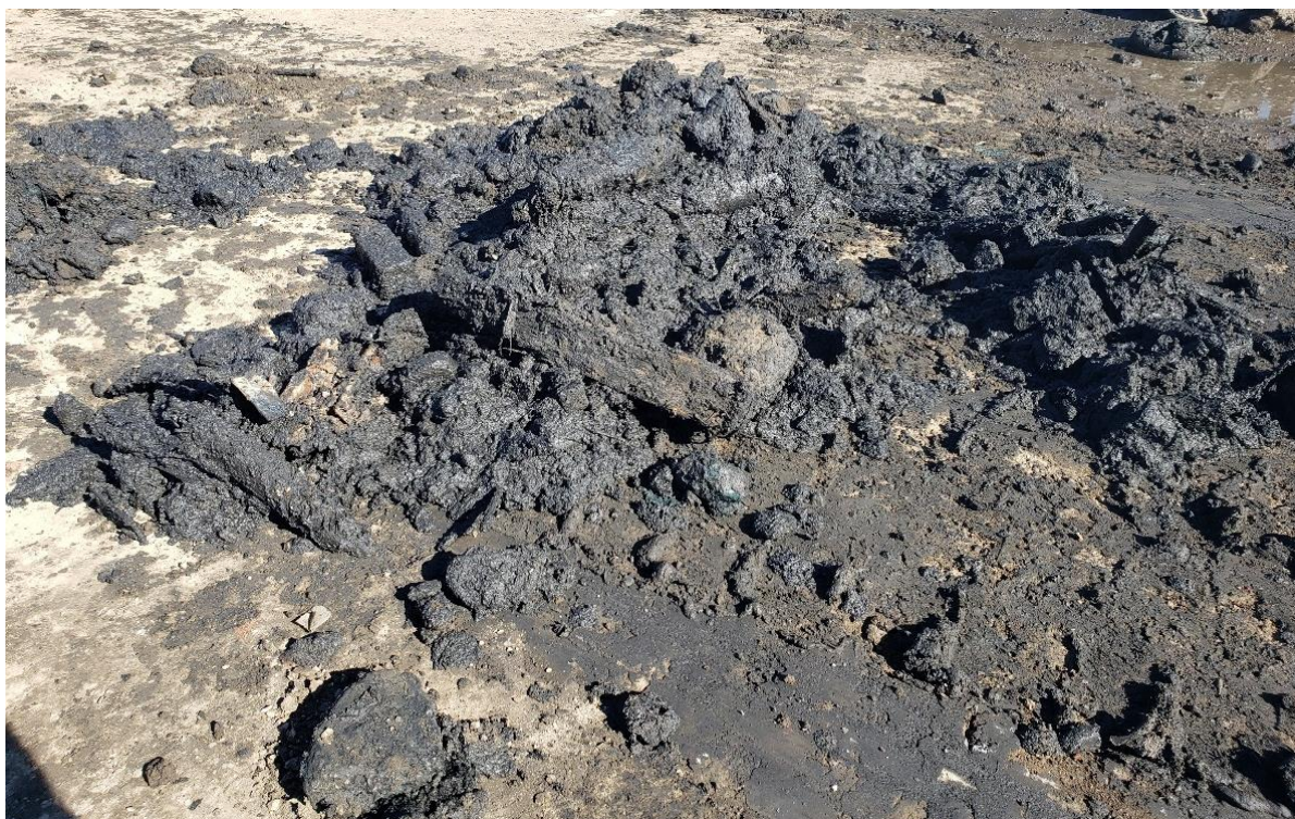
Photograph 2 – Close up of the condition of the material to be reviewed, front view.