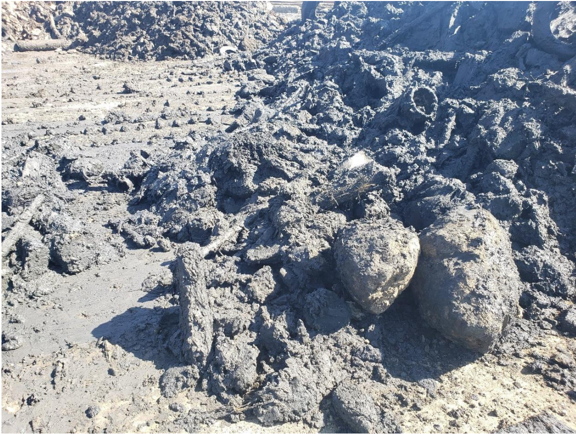
Photograph 4 – Example of rocks, front view.