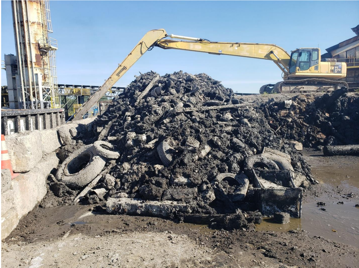
Photograph 1 – View of debris pile to be reviewed, front view.

The recovered material was spread by machine on a flat hard surface to allow for an archaeologist to clearly review it. The reviewed material was comprised of mostly oily mud with debris comprised of concrete, wood, rocks, tires and miscellaneous metal (Photograph 2, 3, 4). No items of potential interest were observed.