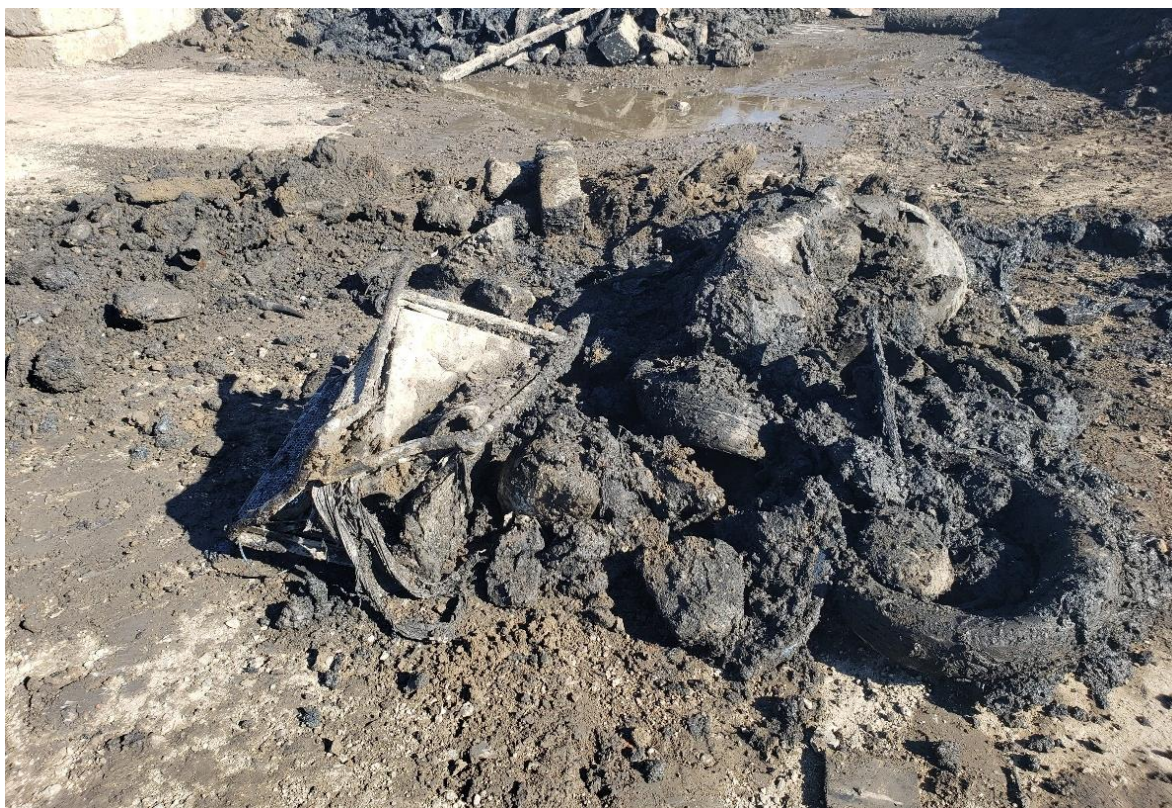
Photograph 3 – View of concrete, wood, tire and metal front view.