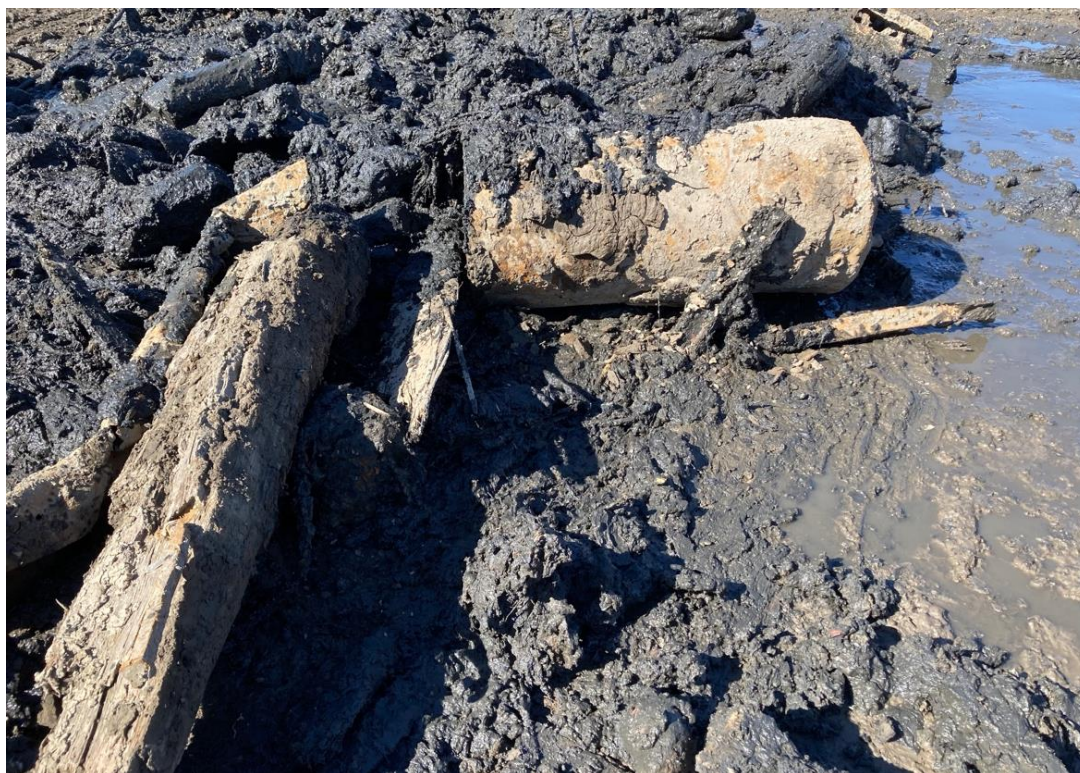
Photograph 3 – View of examples of wood and metal front view.