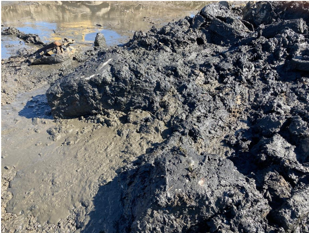
Photograph 4 – Example of rocks, front view.