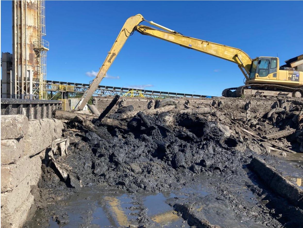
Photograph 1 – View of debris pile to be reviewed, front view.

The recovered material was spread by machine on a flat hard surface to allow for an archaeologist to clearly review it (Photograph 1). The reviewed material was comprised of wet, oily mud with debris comprised of wood fragments, rocks, tires, clay sewer pipe fragments and miscellaneous metal (Photograph 2, 3, 4, 5, 6 and 7). No items of potential interest were observed.