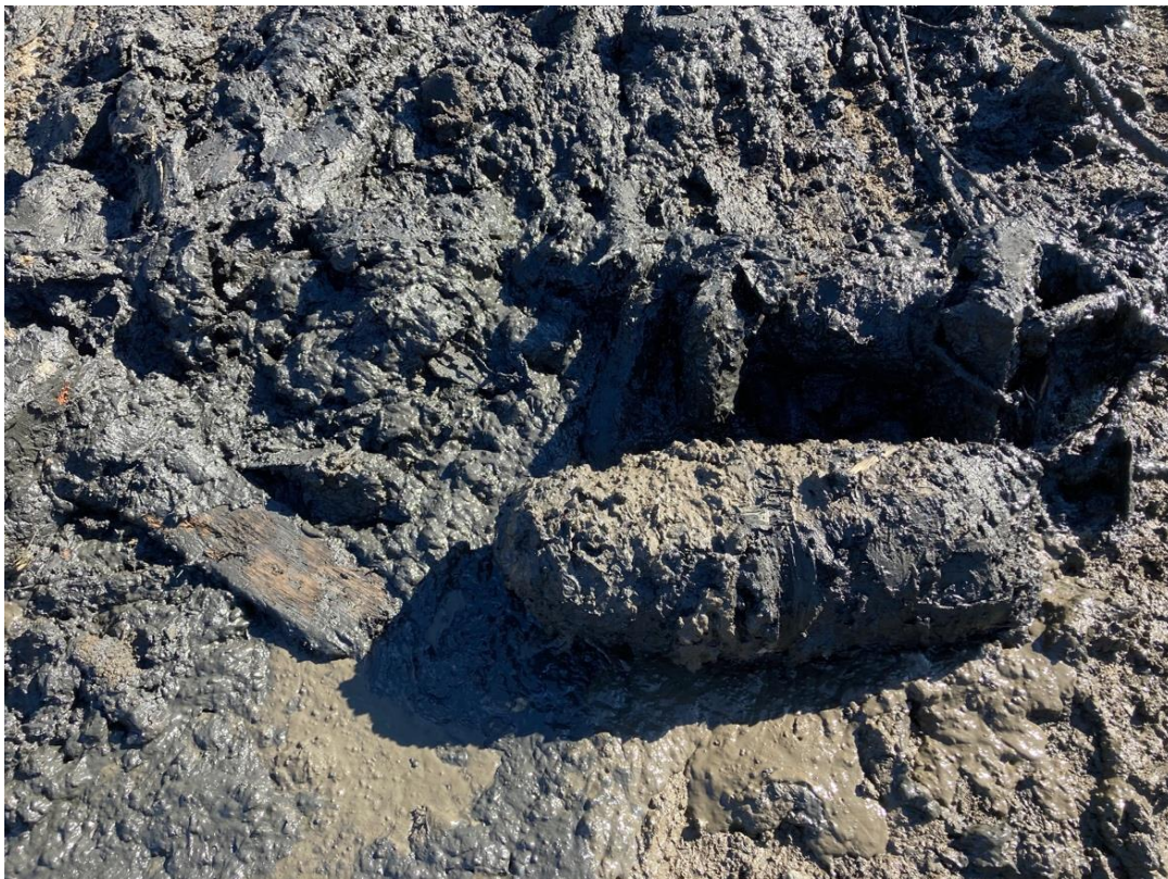
Photograph 5 – View of wood fragments.