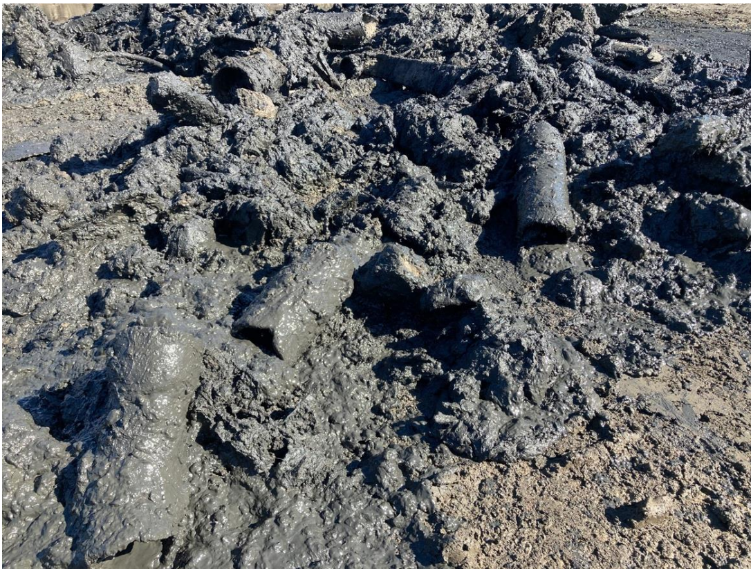
Photograph 7 – View of clay sewer pipe fragments.