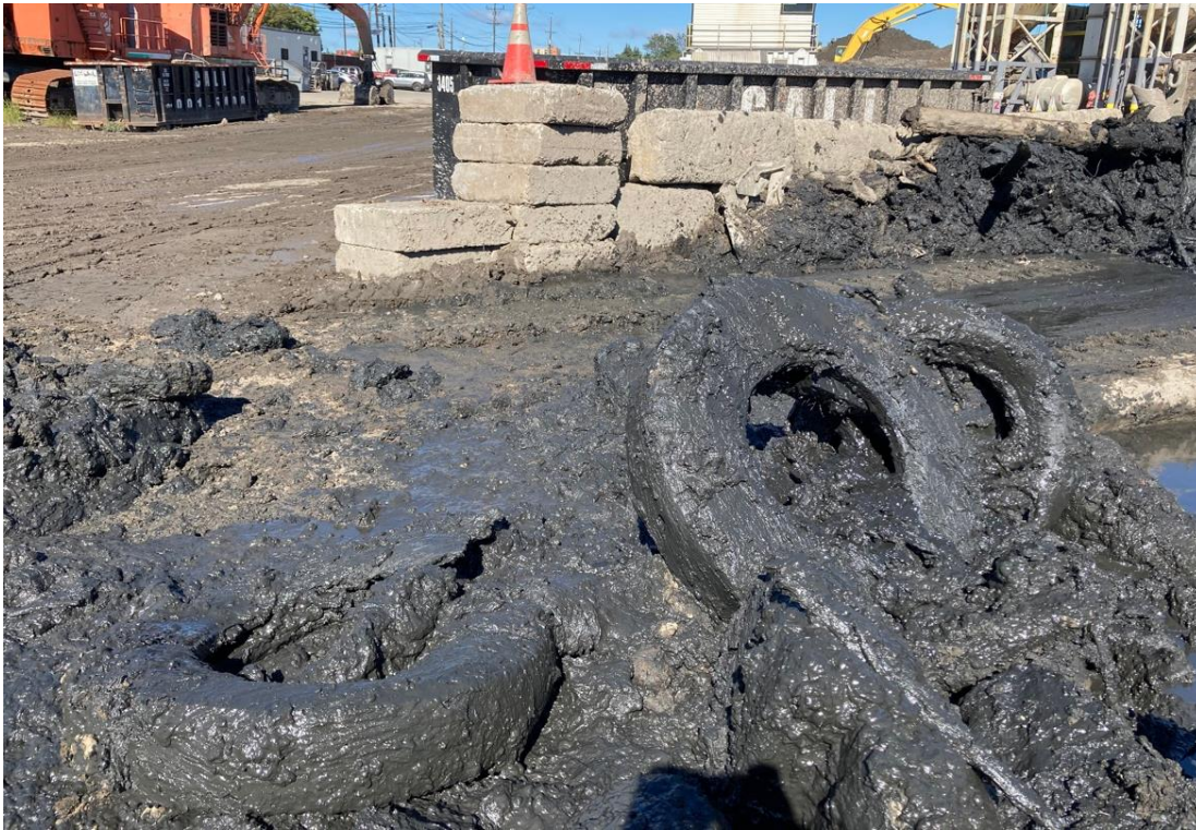
Photograph 6 – View of tires.