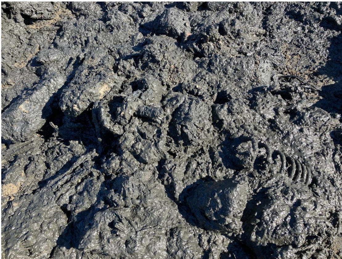
Photograph 2 – Close up of the condition of the material to be reviewed, front view.