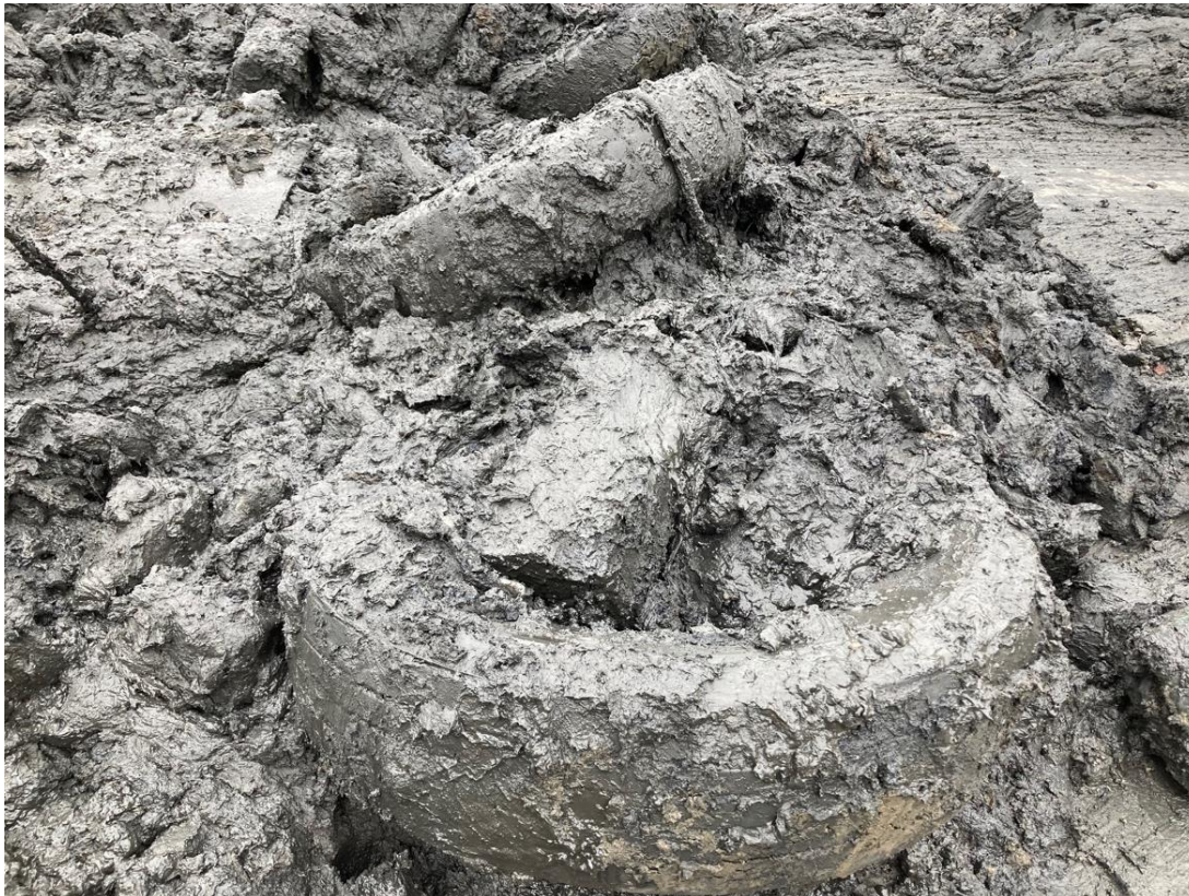
Photograph 3 – View of tire and metal front view.