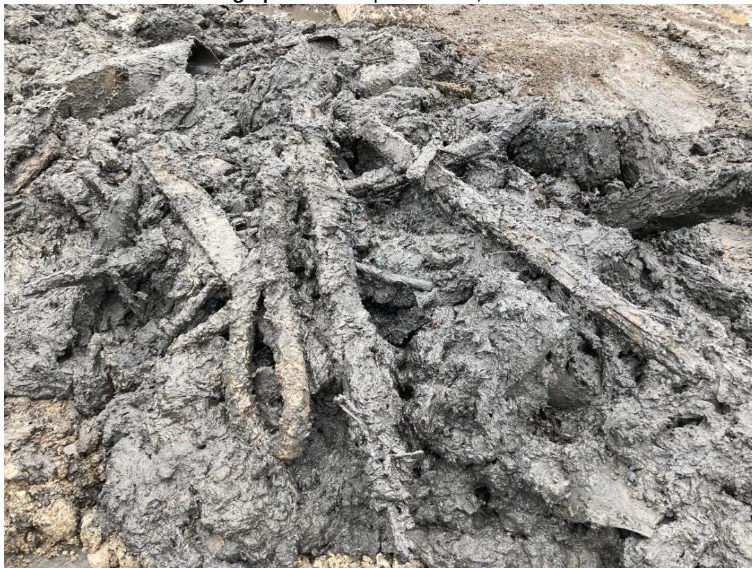
Photograph 5 – View of wood fragments.