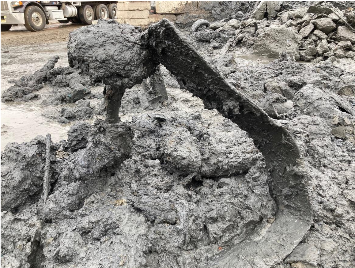
Photograph 6 – View of metal and car parts.