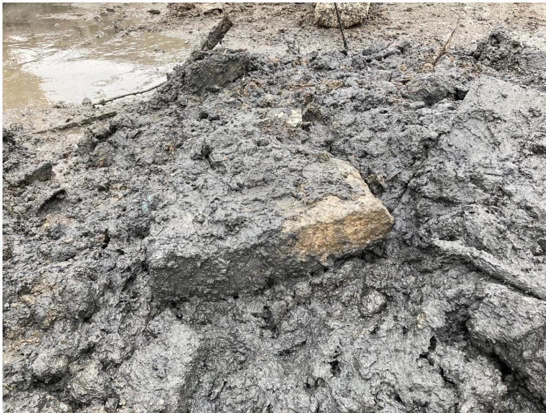
Photograph 4 – Example of rocks, front view.