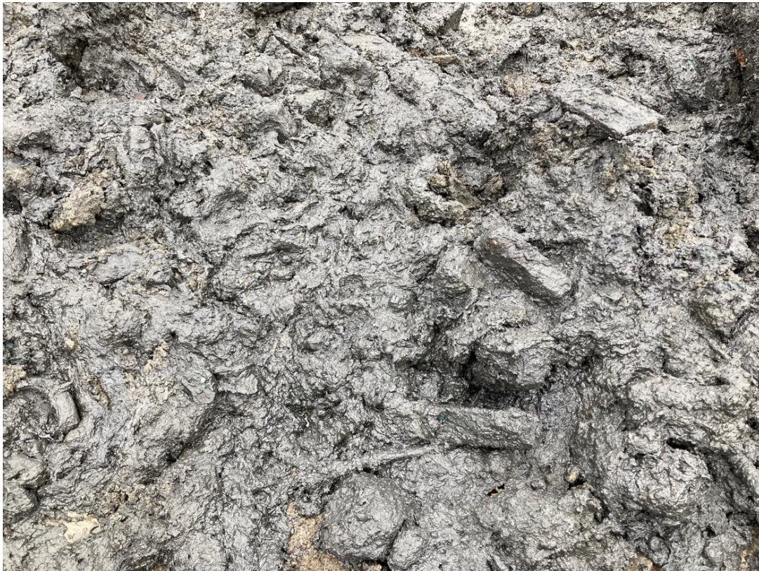
Photograph 2 – Close up of the condition of the material to be reviewed, front view.