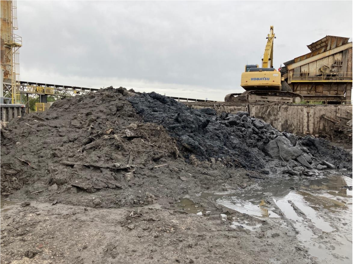
Photograph 1 – View of debris pile to be reviewed, front view.

The recovered material was spread by machine on a flat hard surface to allow for an archaeologist to clearly review it (Photograph 1). The reviewed material was comprised of mostly oily mud with debris comprised of tires, rocks, wood fragments, miscellaneous metal, and car parts (Photograph 2, 3, 4, 5 and 6). No items of potential interest were observed.