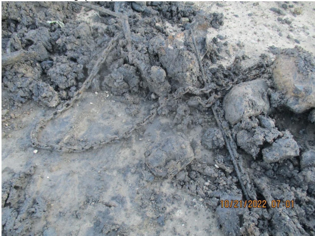
Photograph 3 – View of chains, front view.