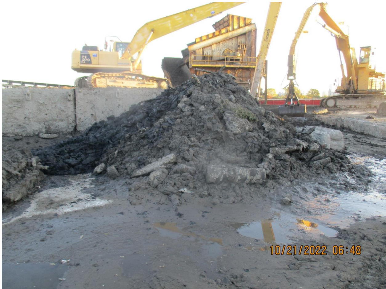
Photograph 1 – View of debris pile to be reviewed, front view.

The recovered material was spread by machine on a flat hard surface to allow for an archaeologist to clearly review it (Photograph 1). The reviewed material was comprised of mostly oily mud with debris comprised of tires, rocks, wood fragments, miscellaneous metal, and chains (Photographs 2 and 3).