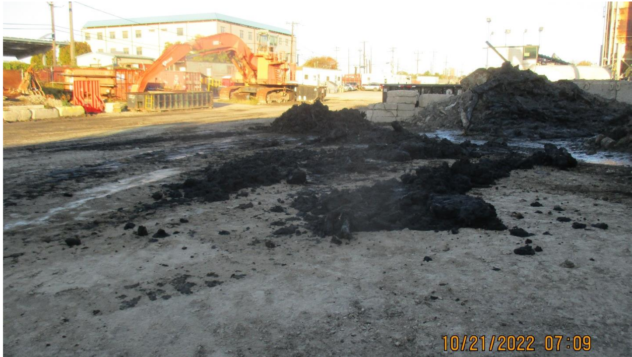
Photograph 2 – Spread out material to be reviewed, front view.