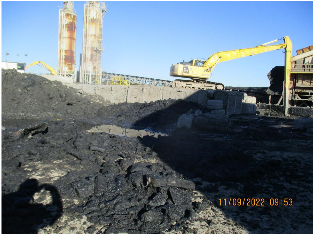
Photograph 1 – View of debris pile to be reviewed, front view.

The recovered material (Photograph 1) was spread by machine on a flat hard surface to allow for an archaeologist to clearly review it (Photograph 2). The reviewed material was comprised of mostly oily mud with debris comprised of tires, rocks, wood fragments and miscellaneous metal.