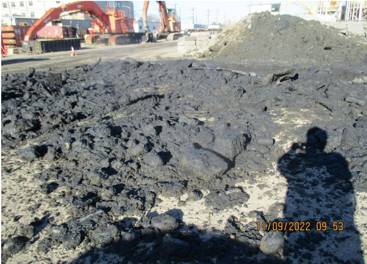
Photograph 2 – Spread out material to be reviewed, front view.