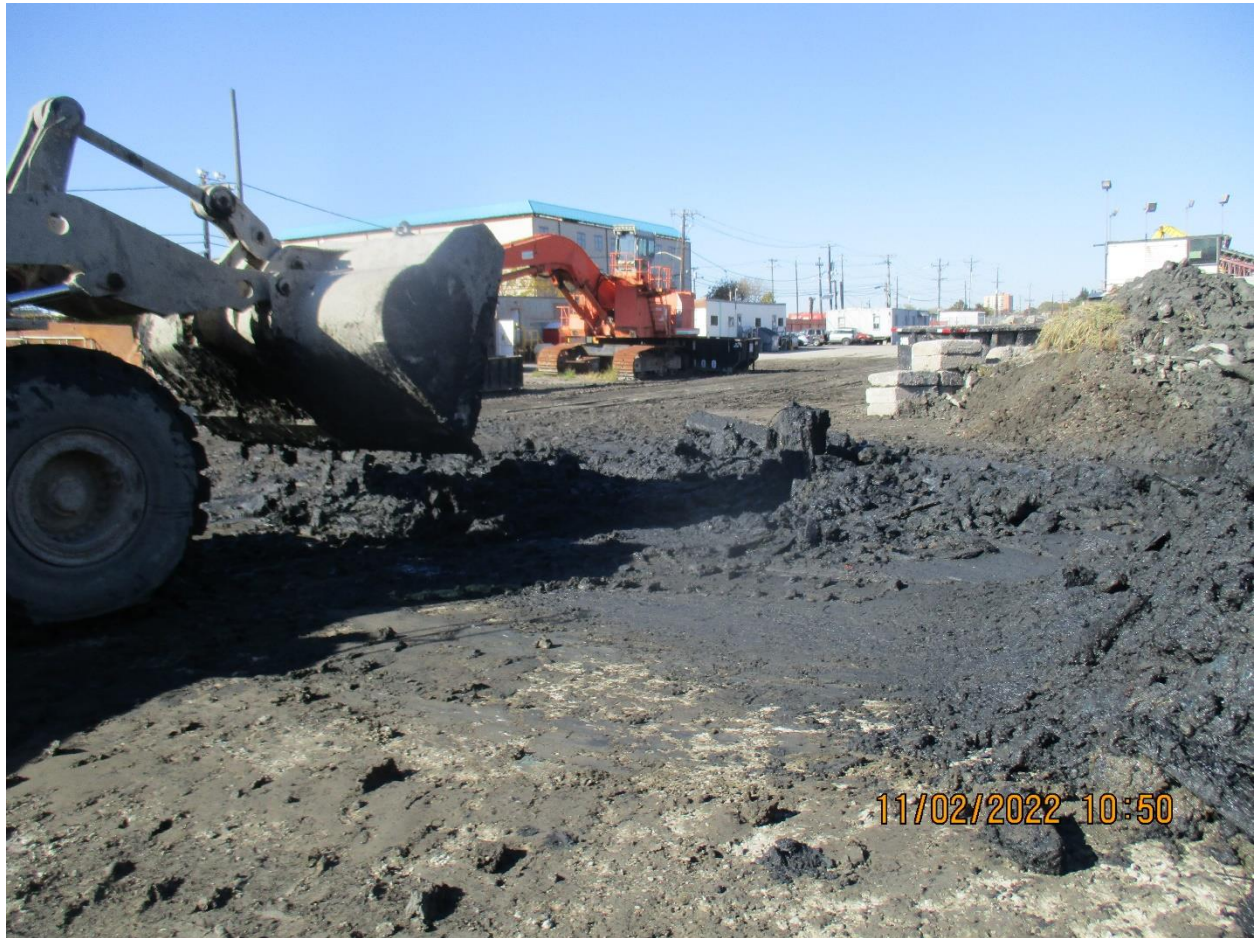
Photograph 2 – Spread out material to be reviewed, front view.