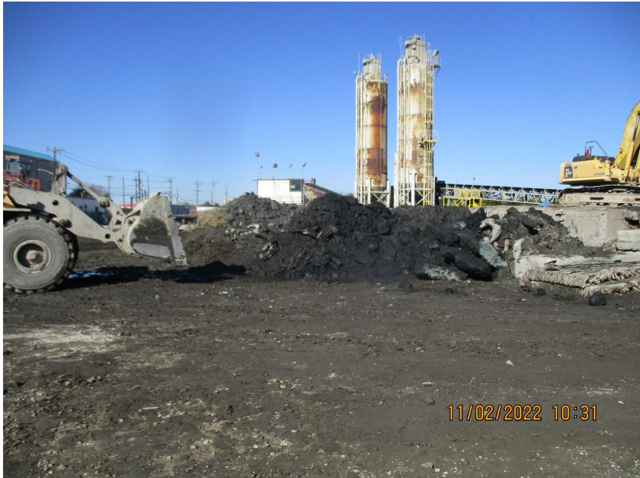
Photograph 1 – View of debris pile to be reviewed, front view.

The recovered material (Photograph 1) was spread by machine on a flat hard surface to allow for an archaeologist to clearly review it (Photograph 2). The reviewed material was comprised of mostly oily mud with debris comprised of tires, rocks, wood fragments, and miscellaneous metal.