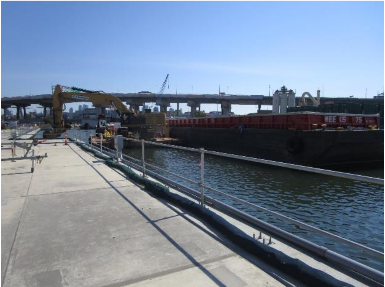
Photograph 5. Dredging adjacent to Project facility, 595/659 Smith Street, facing northeast (Chronicle Heritage 2024).