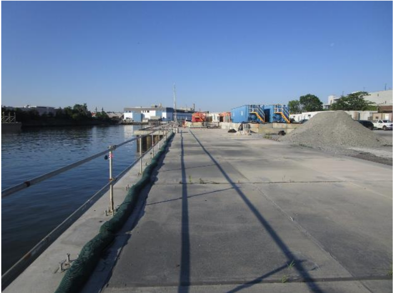
Photograph 1. Project facility, 595/659 Smith Street, facing southwest. Area to be dredged is at base of railing (left)(Chronicle Heritage 2024).