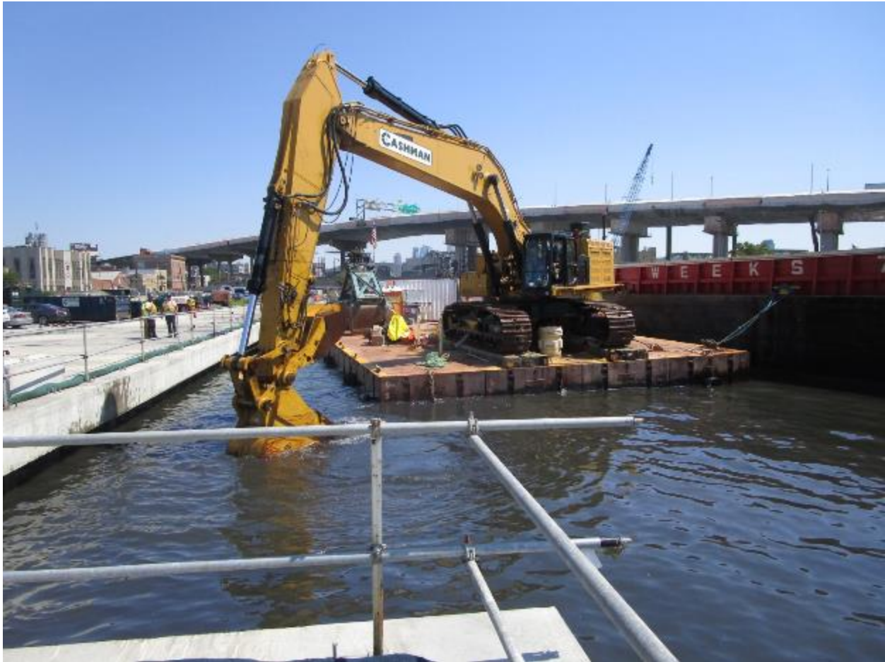
Photograph 8. Dredging adjacent to Project facility, 595/659 Smith Street, facing northeast.