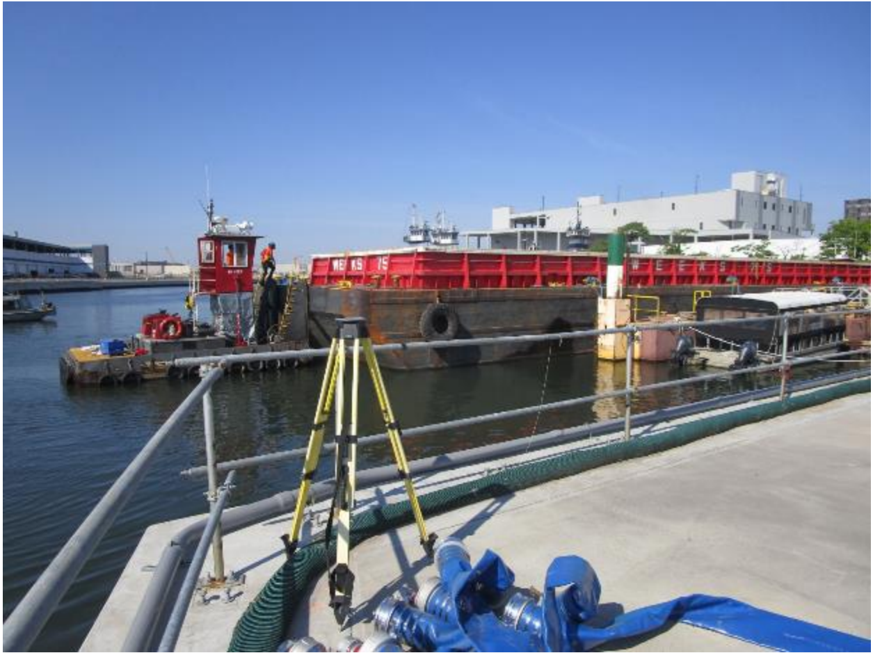
Photograph 4. 1000-ton Weeks 75 barge moved from berth (Chronicle Heritage 2024).