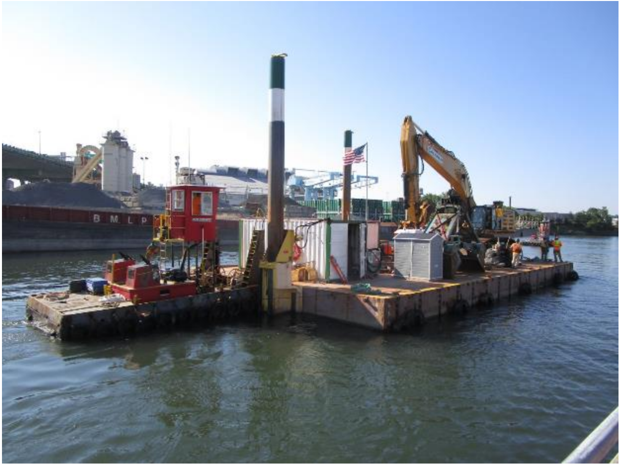
Photograph 3. Dredging barge moving into location (Chronicle Heritage 2024).