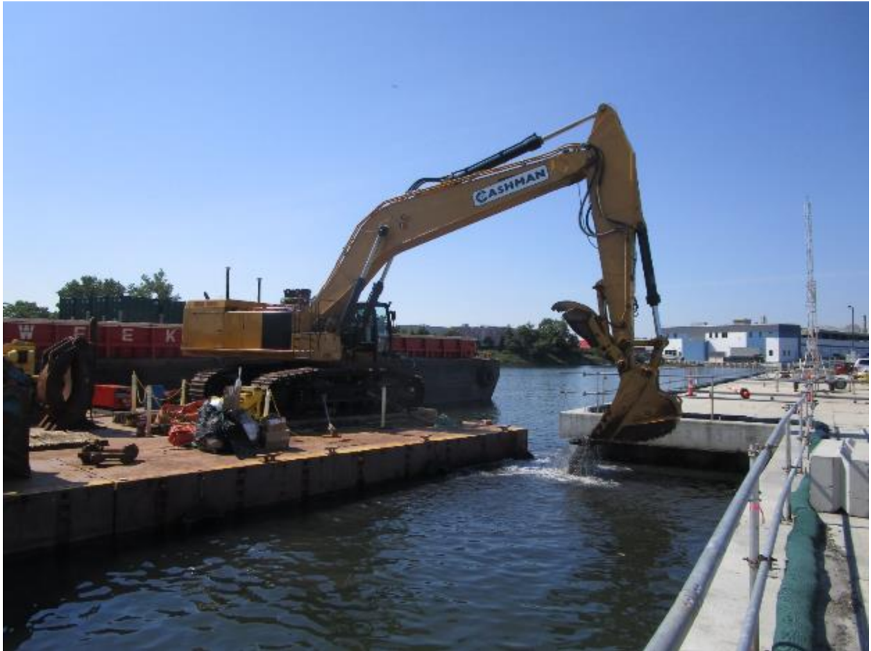
Photo 6. Dredging adjacent to Project facility, 595/659 Smith Street, facing southeast (Chronicle Heritage 2024).