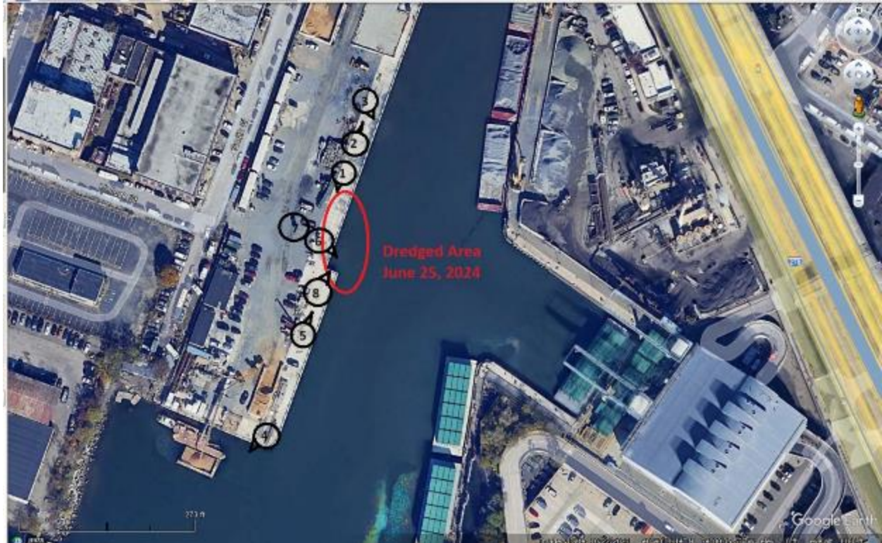
Figure 2. Results map of June 25, 2024 Level 1 archaeological monitoring (Base Map Google Earth June 27, 2024).

Mr. Button observed only old cribbing timbers and wood debris from the day's operations. No objects of interest were identified.