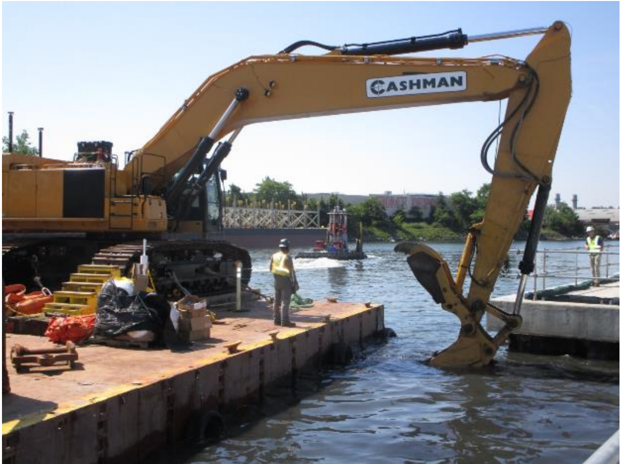
Photograph 7. Cashman excavator operator and crew chief inspect dredged debris in bucket.