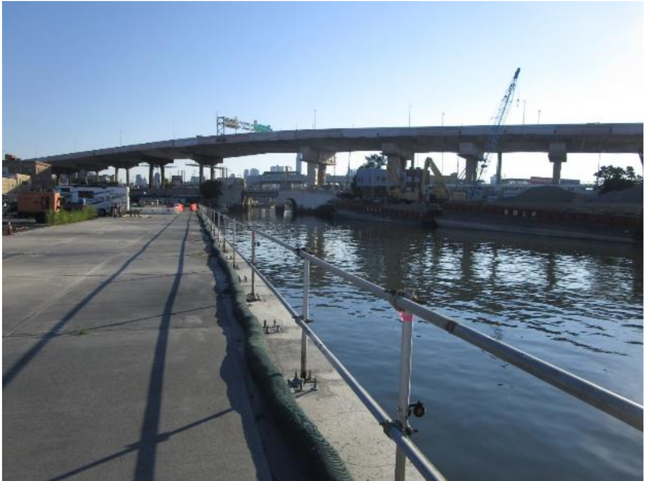
Photograph 2. Project facility along Gowanus Canal, facing northeast towards I-278 Bridge (Chronicle Heritage 2024).