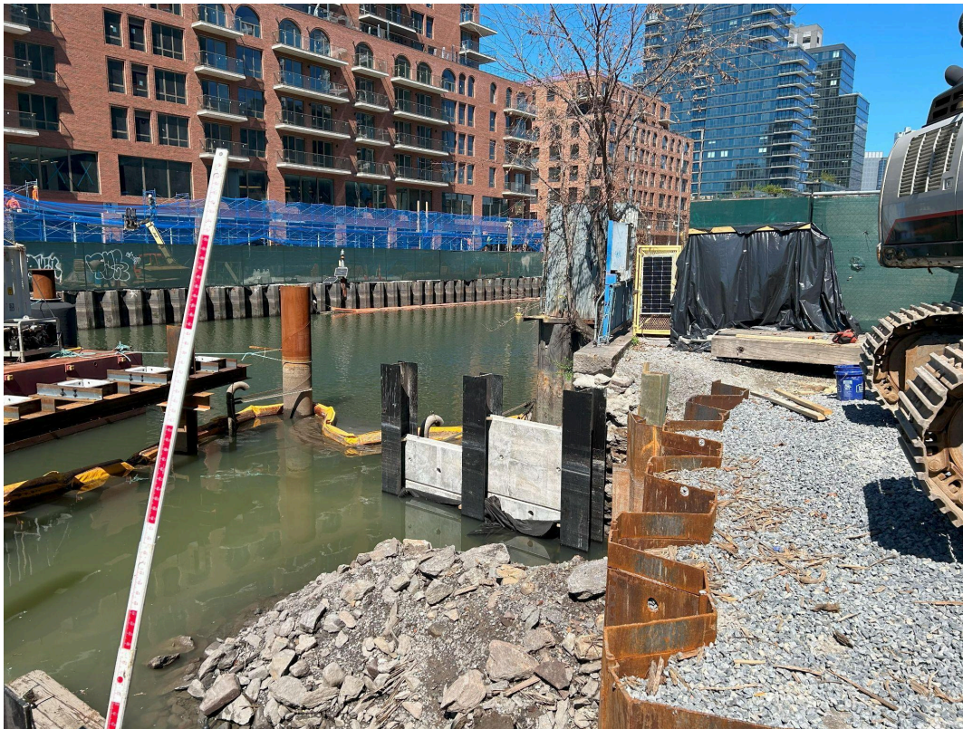
Soldier Pile And Lagging Wall Under Construction