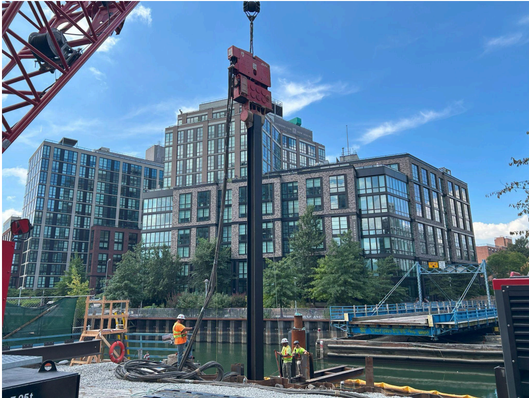
Driving Soldier Pile